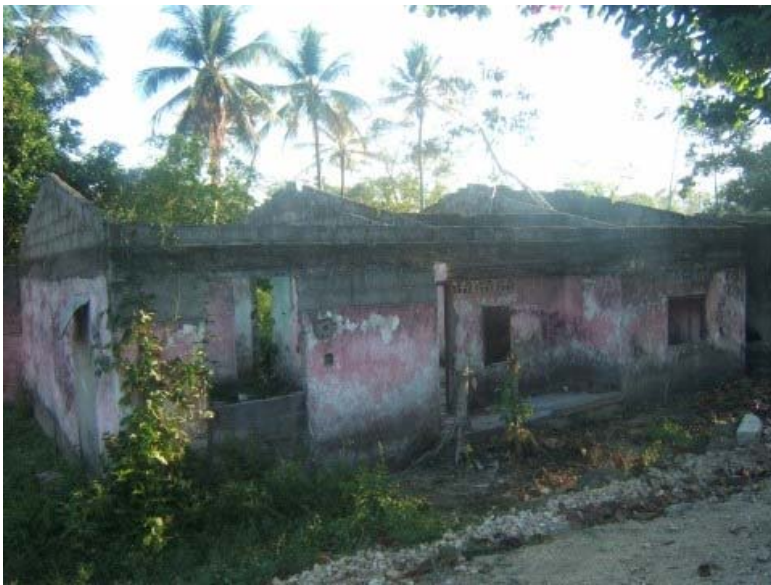
Abandoned homes in Chinulito, Sucre Province, an area under the control of the guerrillas and still unsafe for the community to return.

superimposed on local reality. “All that is being done by the government here in Colombia is being done by reason of the war on terrorism,” notes one religious leader speaking off the record. “That is pure sophistry. The reality is quite different. The reality is that the armed groups want to establish territorial control.” The fact that this view is expressed by people who have felt the full force of terror at the hands on internal armed groups and the state makes the sentiment all the more telling.