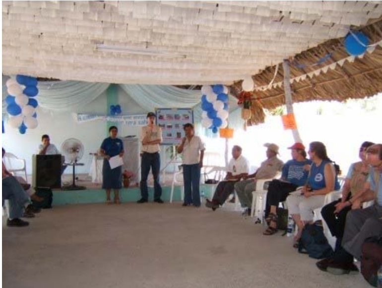
A town meeting in Zambrano, Bolivar Province, where demobilized soldiers are returning to an already poor community that lacks the capacity to support them.

Among Colombians interviewed, particularly those affected by conflict and those working with them, weariness borne of fifty-plus years of violence is pervasive. "People want a political solution to the war," notes