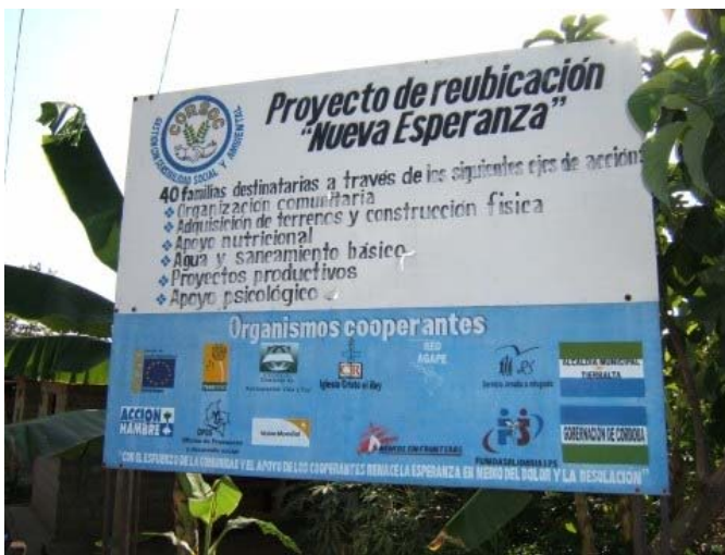
A project signboard in the resettlement community of Nueva Esperanza (New Hope) in Cordoba Province, indicating the various agencies cooperating in the resettlement effort.

For the Catholic hierarchy and the evangelical community alike, faith-based views have represented a vital entry point into the world of more universal values. Evangelical congregations that have declared themselves peace sanctuary churches have done so in part to remind the armed actors of their responsibilities under international humanitarian law not to harm religious structures or facilities and those seeking shelter in them. Other groups have established, with mixed results, zones of peace, extracting agreement from the armed actors not to intervene or interfere within those borders. 6 Government leaders take a dim view of the use of terms such as sanctuaries, peace communities, and humanitarian space, frowning on the initiatives of civil society organizations to carve out preserves free from the conflict. 7 In fact, while international norms and values are widely shared, there is a fierce struggle over their application in the public square. Yet even in criticizing the activities of humanitarian and human rights groups, as noted in the discussion of Terrorism below, the authorities affirm their own fidelity to international norms.