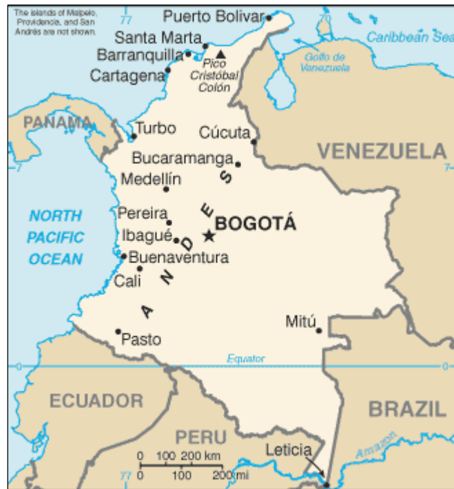
CIA World Factbook

country's Afro-Colombian minority, many of them concentrated in the Atlantic and Pacific coastal regions. UNDP's 2005 Human Development Report ranks Colombia 69th of 177 countries according to indicators of social and economic development. This ranking places Colombia in the "medium" human development group, behind countries (in order of descending rank) such as Argentina, Chile, Costa Rica, Cuba, Mexico, and Brazil but ahead of Venezuela, Peru, Ecuador, Paraguay, Nicaragua, and Haiti. The ranking suggests that Colombia has significant resources of its own that can be brought to bear on its own humanitarian crisis.