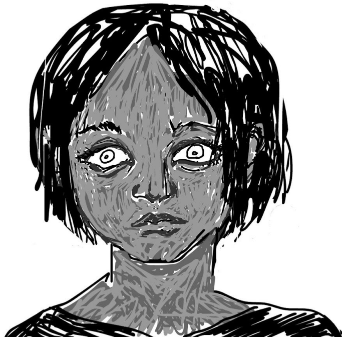
Description: An image from the short animation 'Phantasmagoria', centered around a young girl's journey through her own distorted memories.