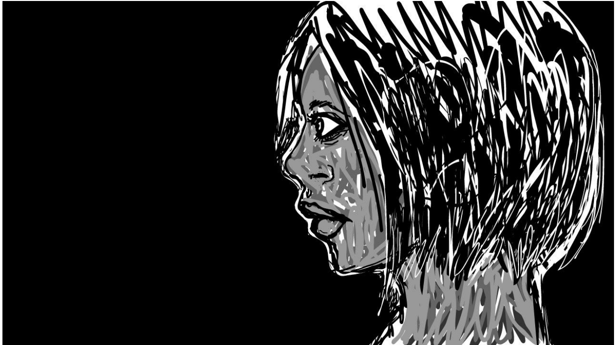
Description: An image from the short animation 'Phantasmagoria', centered around a young girl's journey through her own distorted memories.