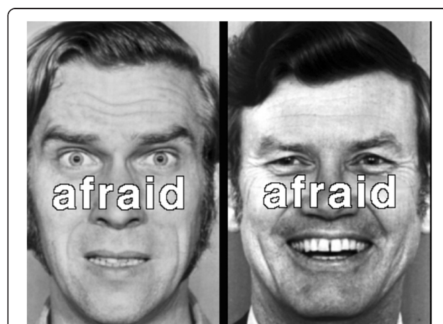
Figure 1 The face on the left is an example of a Congruent trial, in which the word matched the facial expression. The face on the right is an example of an Incongruent trial, in which the word did not match the facial expression.

Participants completed four runs (6 minutes and 40 seconds each), but fMRI (and behavioral) analyses included only the first two runs to avoid decrements in