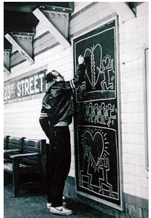
NYC Subway Drawing