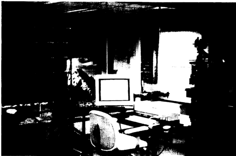
Figure 2. Cog (arms not yet attached), the front end processor and bank of monitors.