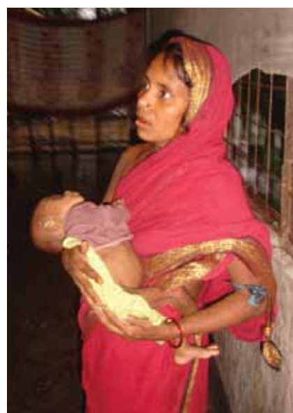
Using community based health workers to track and treat malnutrition in Bangladesh is proving far more effective than the normal hospital based treatment.