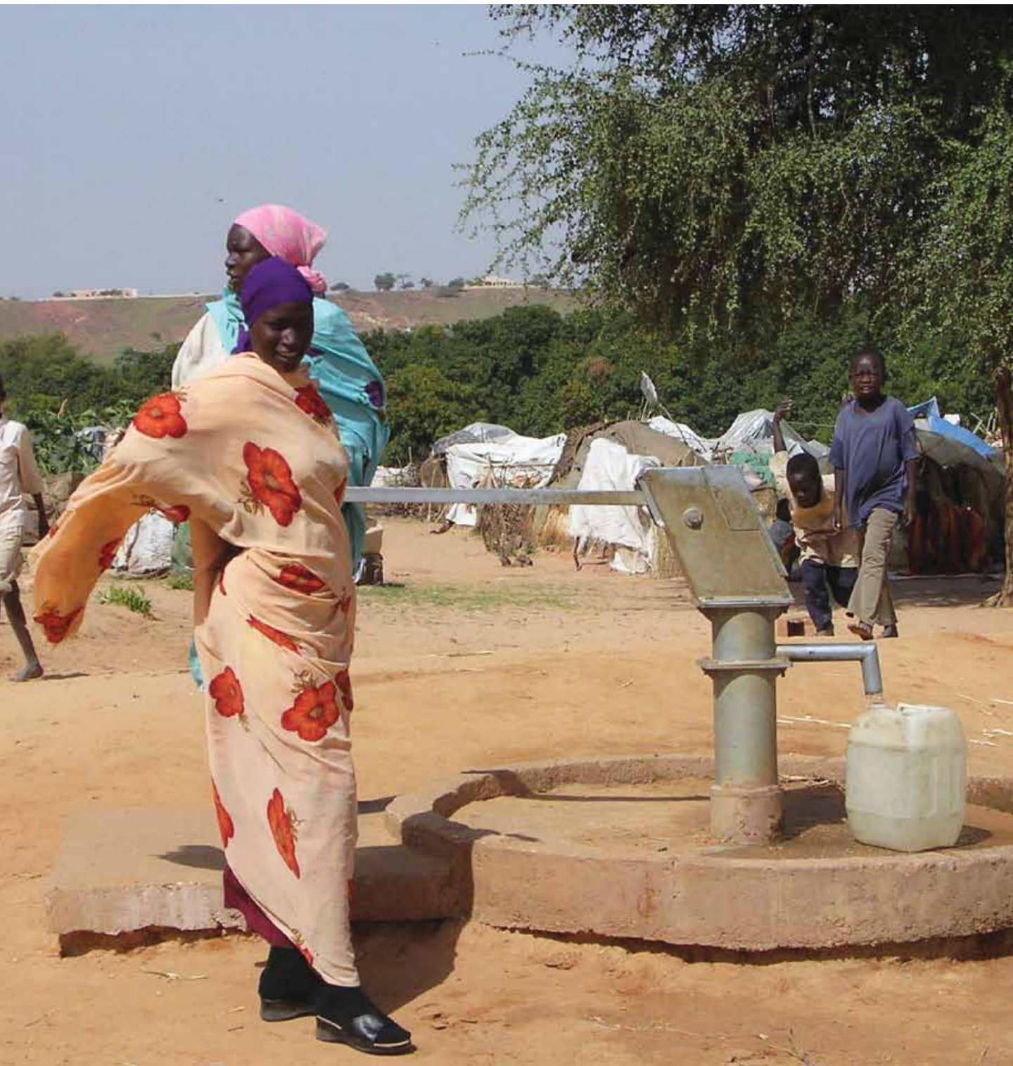
As IDP camps become permanent new towns in Darfur, services, such as water and health care have to be provided in a more sustainable way.