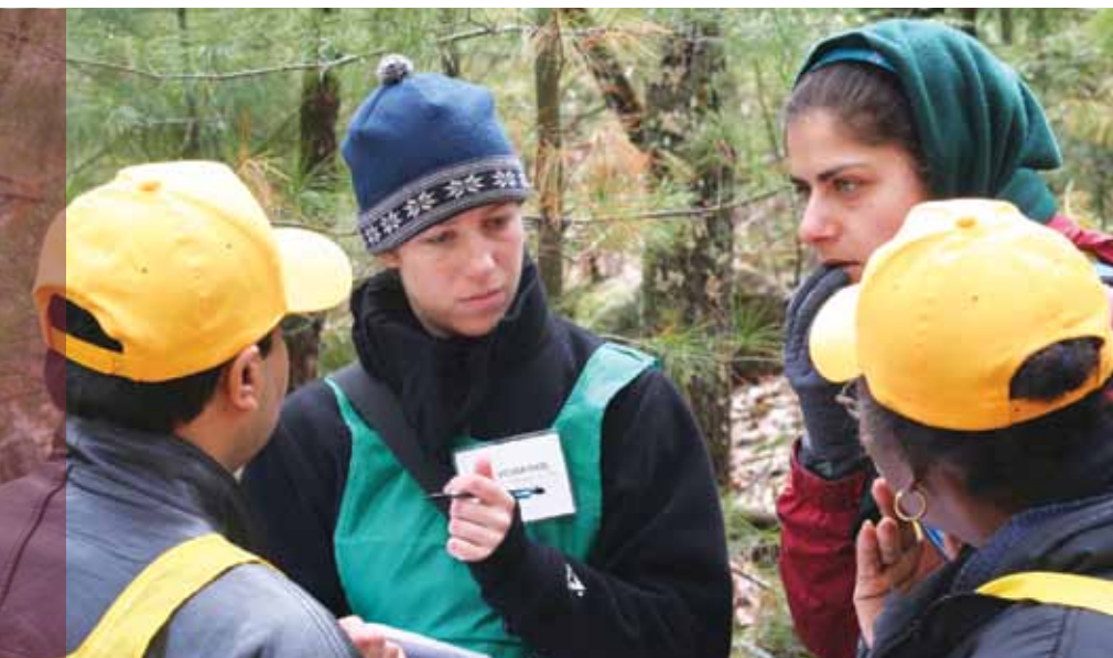
Experiential learning in disaster simulation exercises is a vital part of the education experience of masters students at Tufts.