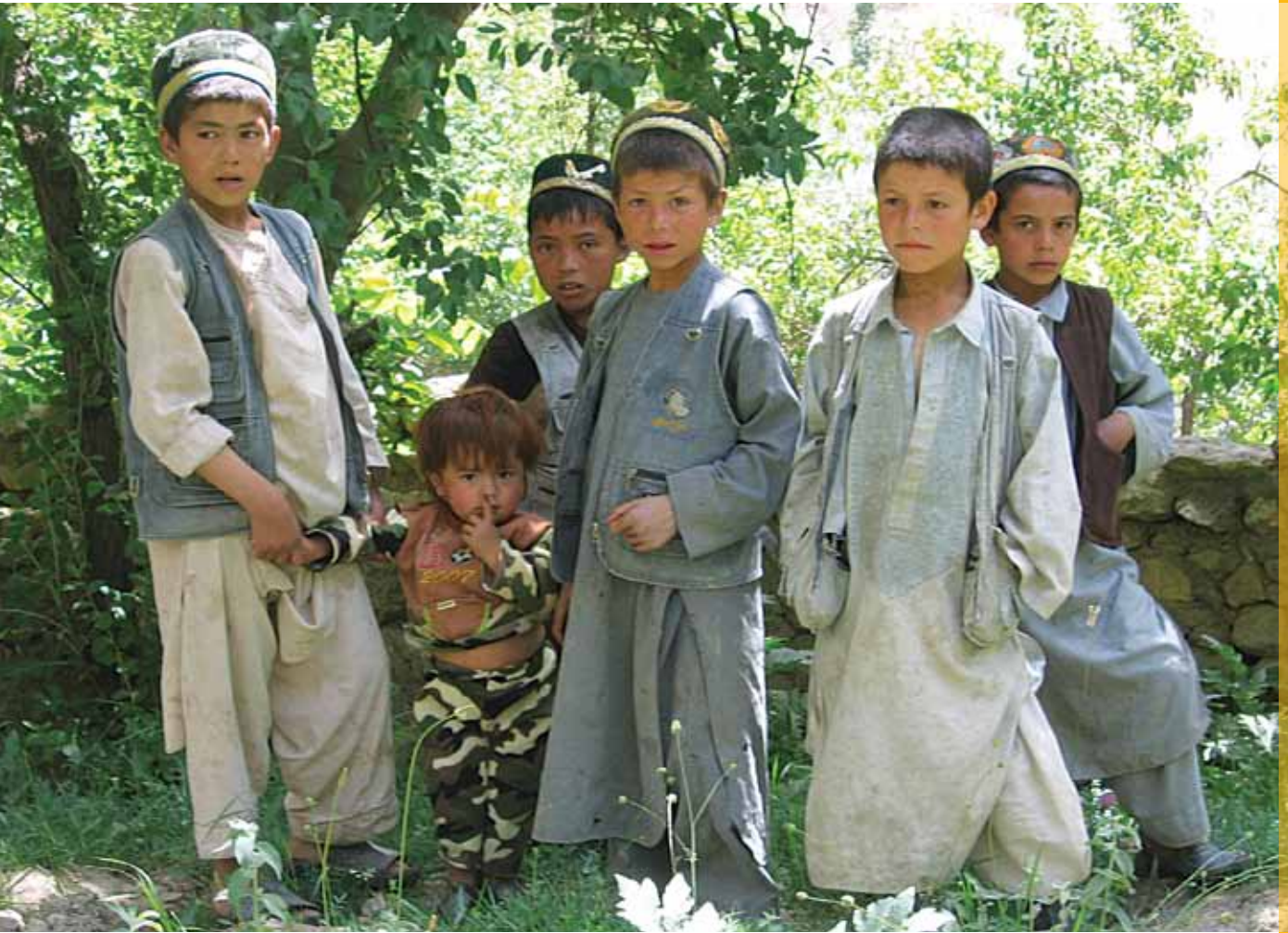
Poor governance and corruption is identified by many Afghanis as the leading drivers of violence in the country. Where security can be reestablished, schools, health care and markets follow.