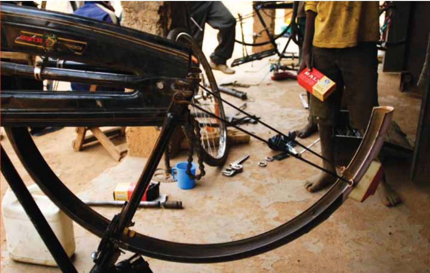
Bicycle repair shops in displacement camps offer young men one of the few forms of employment and a place to spend time with friends.