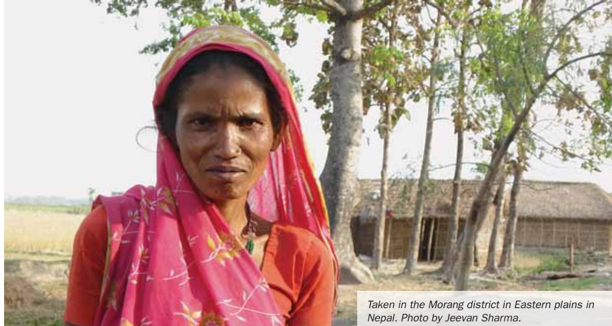
Taken in the Morang district in Eastern plains in Nepal.

and increased monetization of commodity exchanges and of social relationships. Data collection and ethnographic research on this project started in the spring of 2011. Expected outputs include reports, workshops, and peer-reviewed publications. The research report will become available in late 2011.