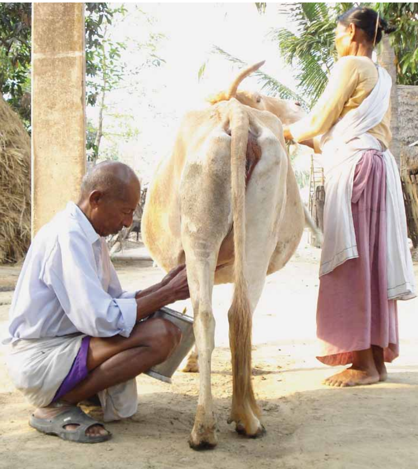
Taken in the Morang district in Eastern plains in Nepal. Our research in this area revolves around local perceptions of conflict, aid and social transformation.