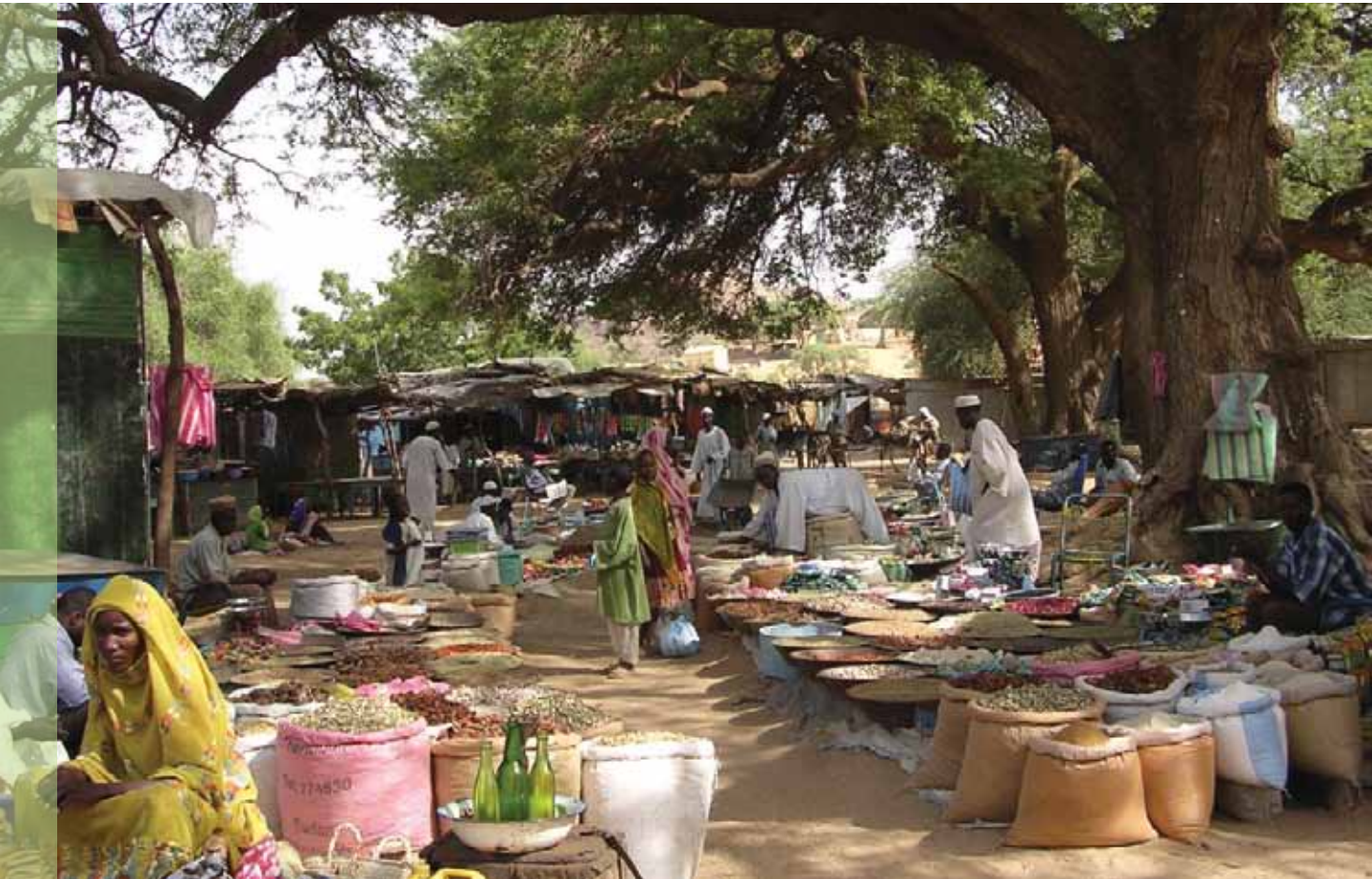
A vibrant market in Kutum, North Darfur, illustrating the complexity and connectedness of livelihood strategies and market system in the area prior to the conflict.