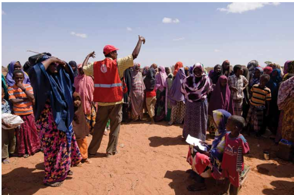
Somali Red Crescent volunteers distribute relief goods supplied by the ICRC to families displaced by fighting in the Galgadud region of Somalia.

Donini, Antonio. March 31, 2011. “Between a Rock and a Hard Place: Integration or https://wikis.uit.tufts.edu/confluence/pages/viewpage.action?pageId=36675386 .or Independence of Humanitarian Action.” International Review of the Red Cross No. 881.