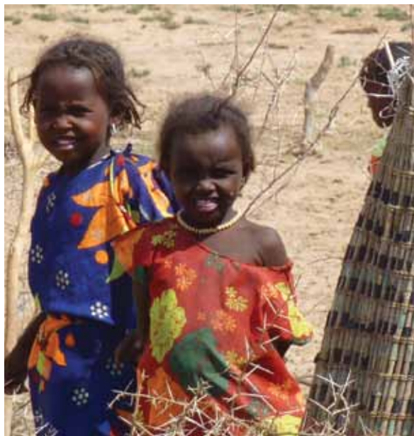
Pastoralist children are often reliant on milk for their nutrition and can suffer periodic hunger when cattle herds have to move away in search of fodder.