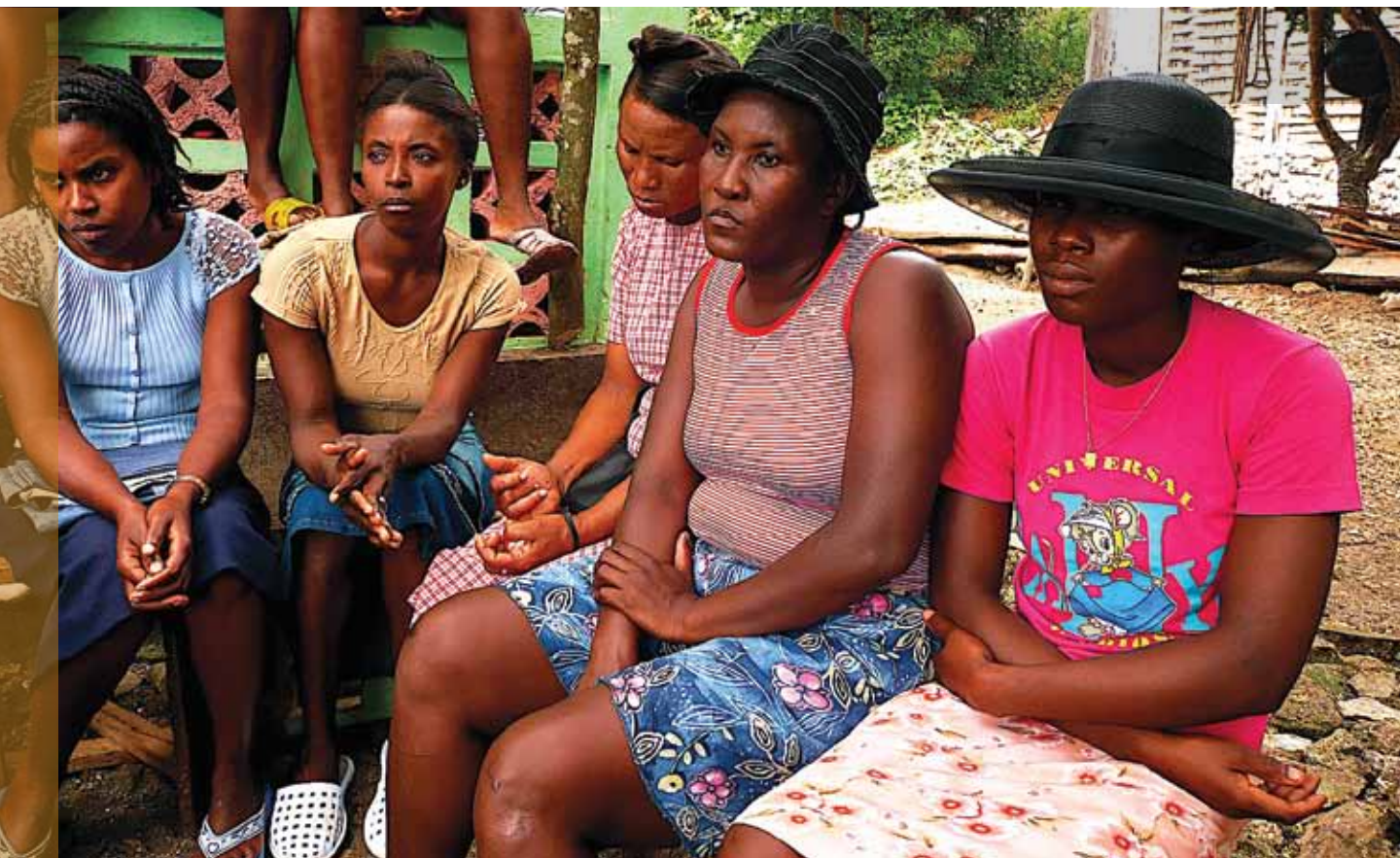
Prior to the earthquake, micro-finance groups were common in Haiti. Now, IDPs across the country are using micro finance and micro savings groups as a vital part of their recovery strategies.