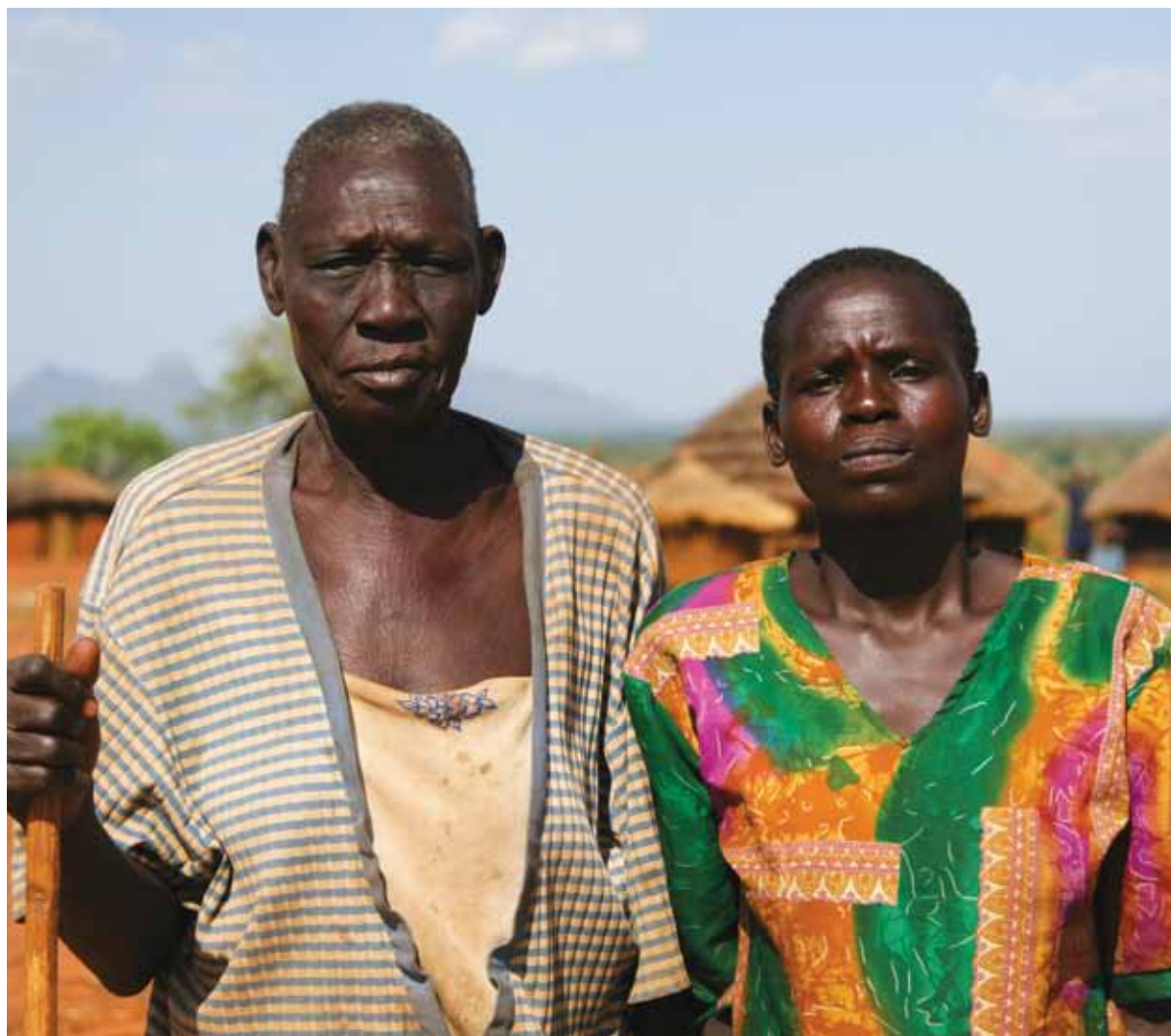
Mother and daughter in Kitgum-Matidi IDP camp. Like many in the war torn north, this mother and daughter had to abandon their own farm and join with neighbors to struggle to gain access to limited land to feed their family.

the government's strategy paper. Tufts/FIC strives to ensure that our work is objective, evidence-based, and widely circulated in our ongoing efforts to positively influence the development of national policy towards the region. We also ensure that government officials are included in our briefings and workshops whenever possible and appropriate.