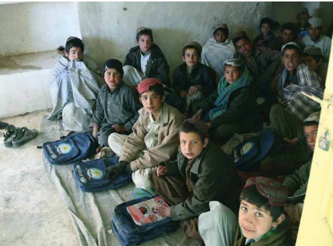
Without security and a cessation of violence, their is little hope of building a future for Afghani youth.