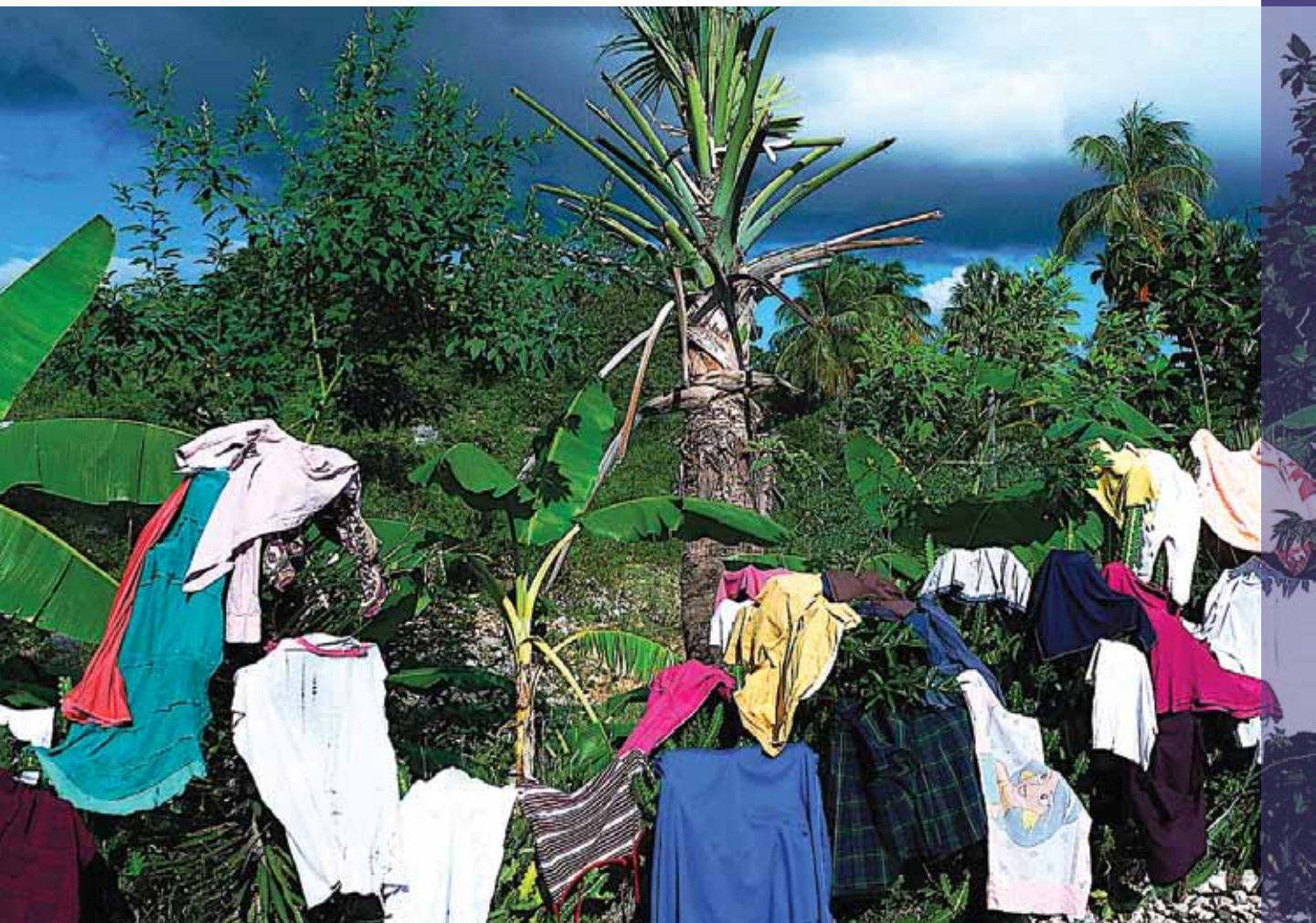
Environmental destruction and bad governance prepared the ground for the devastation wrought by the earthquake in Haiti.