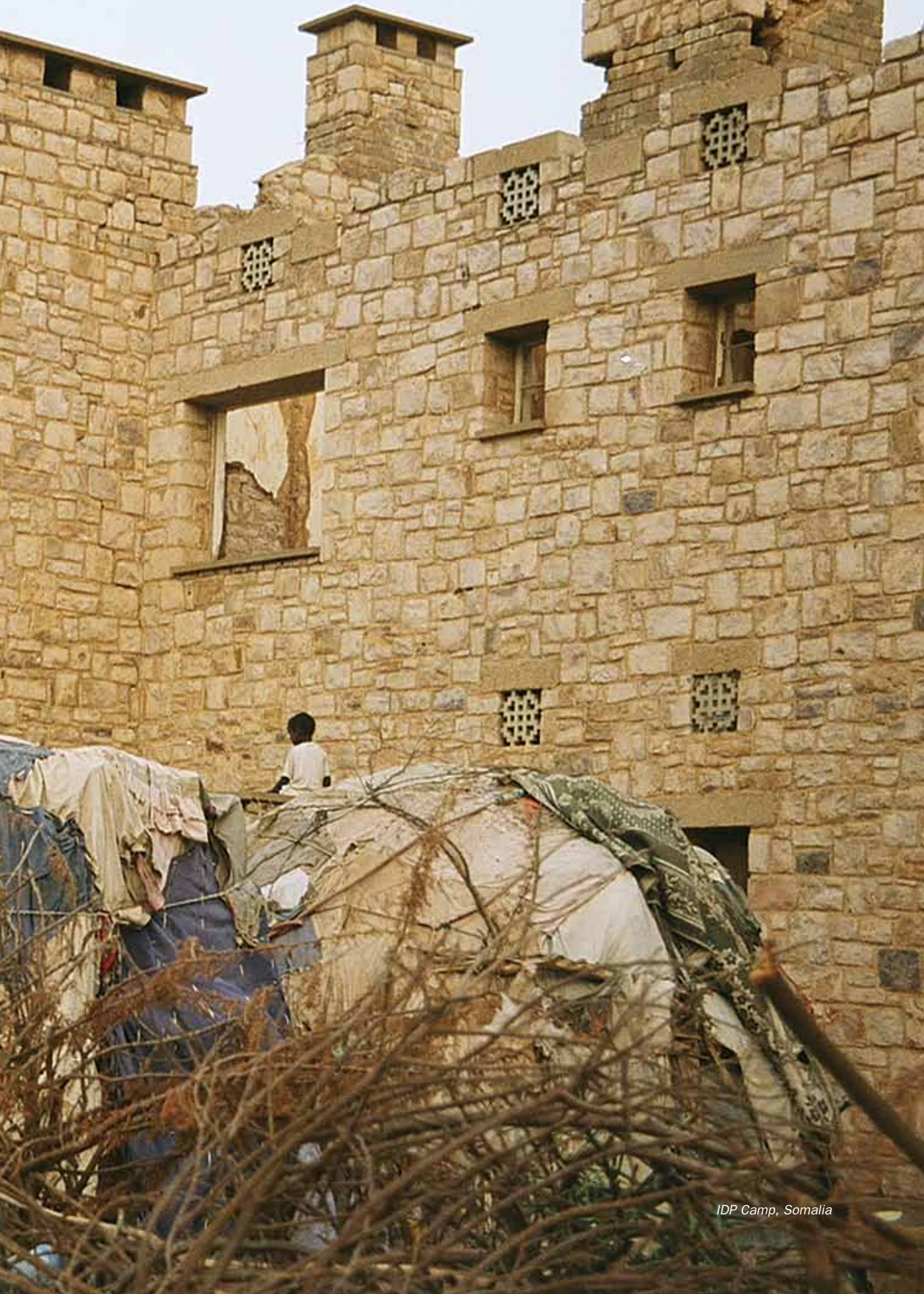
IDP Camp, Somalia