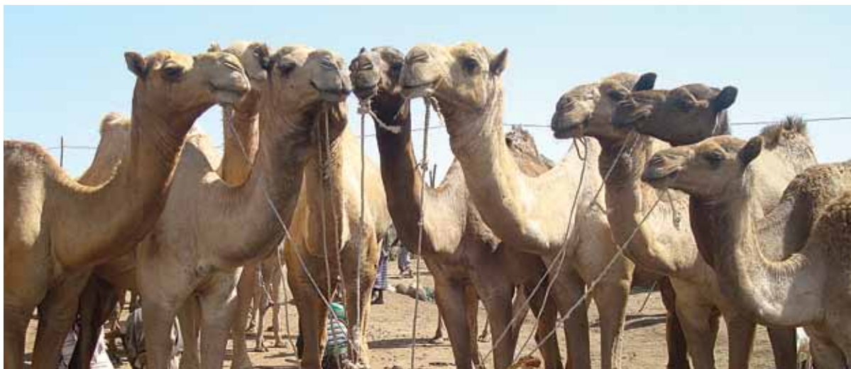
Camels in Kobo market, Amhara Region

Given the increasing level of meat exports from the country, the government is now promoting the setting up of new export abattoirs in the eastern parts of the country (where there are none at the moment) to provide market access for pastoralists.