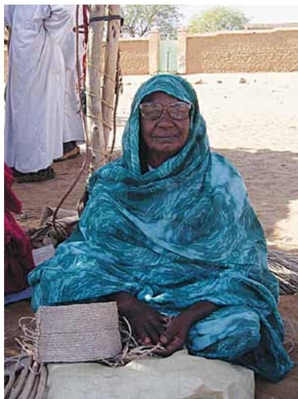
Darfurians used to travel to Libya as economic migrants, working on the mechanized farms and sending their remittances back to their families in Darfur.

Editor for the volume: Livelihoods, Natural Resource Governance and Peacebuilding , Environmental Law Institute/ UNEP/ University of Tokyo. Forthcoming