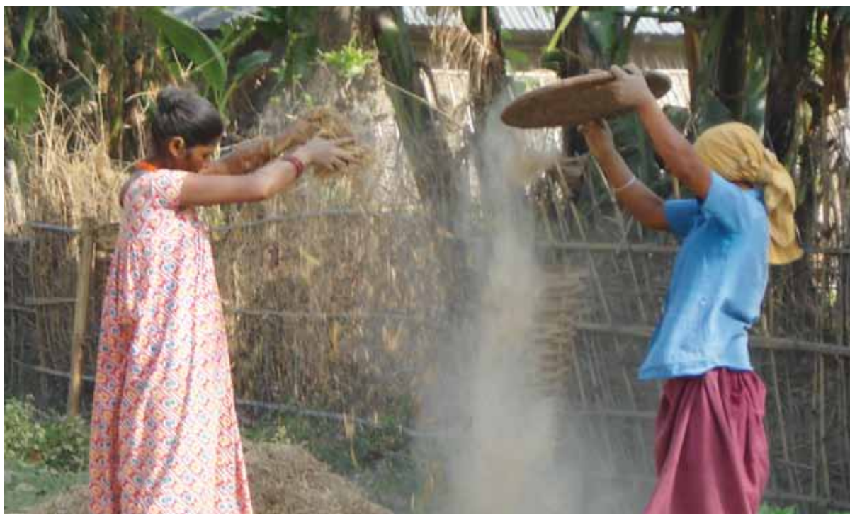
Taken in the Morang district in Eastern plains in Nepal.

“Men and Masculinities in the Maoist Insurgency in Nepal.” A workshop on new researcher’s perspectives on Maoist insurgency in Nepal. CNRS, Berder, France, September 6–9, 2010.