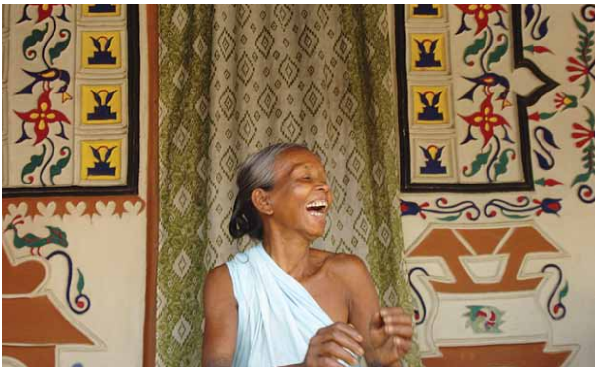
Taken in the Morang district in Eastern plains in Nepal. Our research in this area revolves around local perceptions of conflict, aid and social transformation.