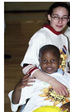
Tufts Giving Camp Volunteers and Participants

note human rights. "If The Office of University Chaplain sponsors and underwrites many outstanding projects throughout the year. Here are some of the many great student projects that received funding from the Office of University Chaplain; The Leonard Carmichael Society's Faculty Waits on You Dinner & Auction, The Muslim Eid Dinner, a talk at the Hillel Center, buying new meditation cushions for the two new Buddhist groups, and the annual "Thanks for Service" Inter-Faith event in November. Another student-run project that receives funding is The Giving Camp. This is a one, two, even three-day event for adults and children with physical and mental challenges. Tufts students plan the events and