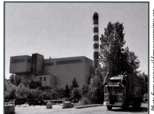
The Wilderness Committee continues to raise awareness about toxic chemicals released from incinerators.

In light of Metro Vancouver's consideration of a waste incinerator on Vancouver Island, the Wilderness Committee created a short, humorous, and creative video on the flaws of burning garbage and the faults in the logic of the supporters of waste incineration. Entitled "Speak Now or Forever Hold Your Breath," the video has garnered almost 2,500 views. It directs viewers to the campaign website of Zero Waste BC and ends with a list of alternatives to burning waste. Said Ben West, Healthy Communities Campaigner for the Wilderness Committee, "Proponents of waste incineration are big corporations that will say almost anything to get these multi-million dollar contracts so we need to get creative to stand up for public health and the environment." See the video at ZeroWasteBC.org . A decision on the Covanta-owned waste incinerator is expected this summer. ◆