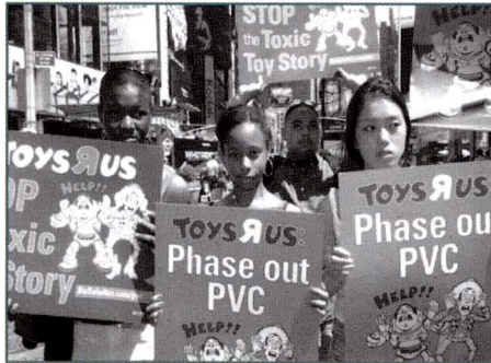
NYPIRG student leaders standing up for toxic-free toys!

Long Islanders can breathe a clean sigh of relief: Covanta, a large waste-to-energy company, has withdrawn plans to expand its garbage incinerator in Hempstead , citing the poor economic conditions. Residents had been concerned over hazardous air emissions and increased traffic in the area. Even better, New York State has deemed recycling to be a top priority on Long Island and elsewhere due to current low recycling rates, a move that further strengthens the environmental movement in the area.