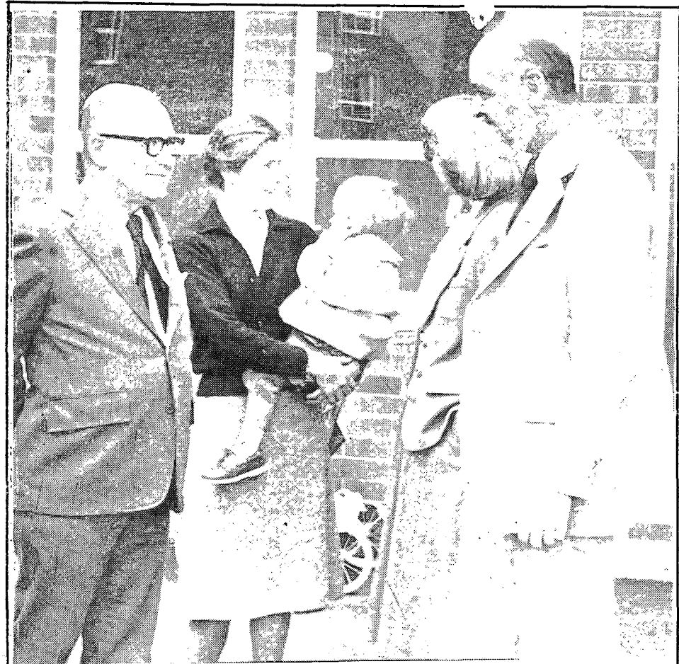
LATIN WAY HAS RECEPTION