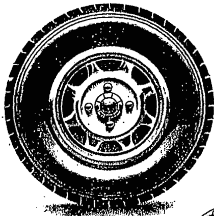
Tires for our trucks would cost more.