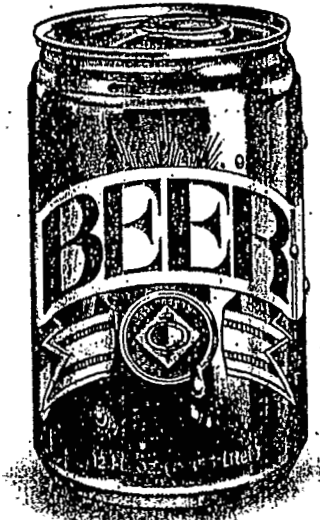
Even the beer we drink would cost more with the proposed tax hike.

T ruck tires? A luxury? We think not. That's why we oppose any increase in the Federal Excise Tax. Any increase at all. Federal Excise Tax is hidden in the price of the product, so most of us don't even know we're paying it. It isn't itemized like a sales tax. And yet it already taxes heavily things most of us use every day. Not luxury items like furs or jewelry or fancy cars. But useful things like tires for our trucks. Common things like fishing rods and reels. Even long distance phone calls we make, and the beer we drink. We believe that there are ways to raise revenues that are more fair than raising the taxes of America's working men and women. Once the excise tax is raised, you'll have no choice but to pay it. So act now. Clip out and send in the coupon below. Let your Senators know that you're not about to take a hike.