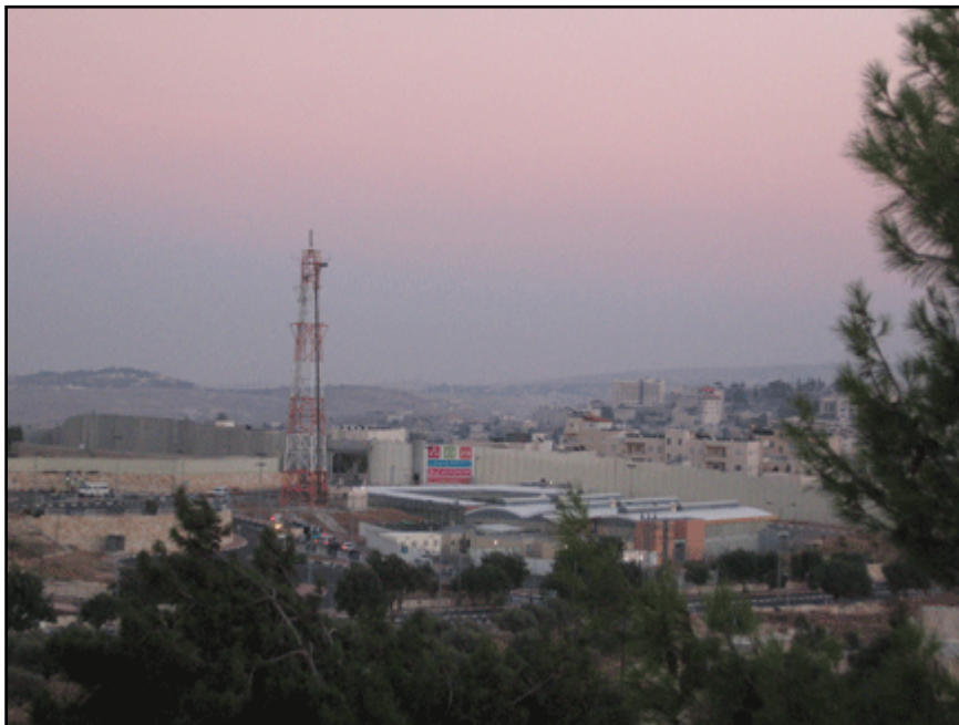
Israeli checkpoint from Jerusalem to Bethlehem.