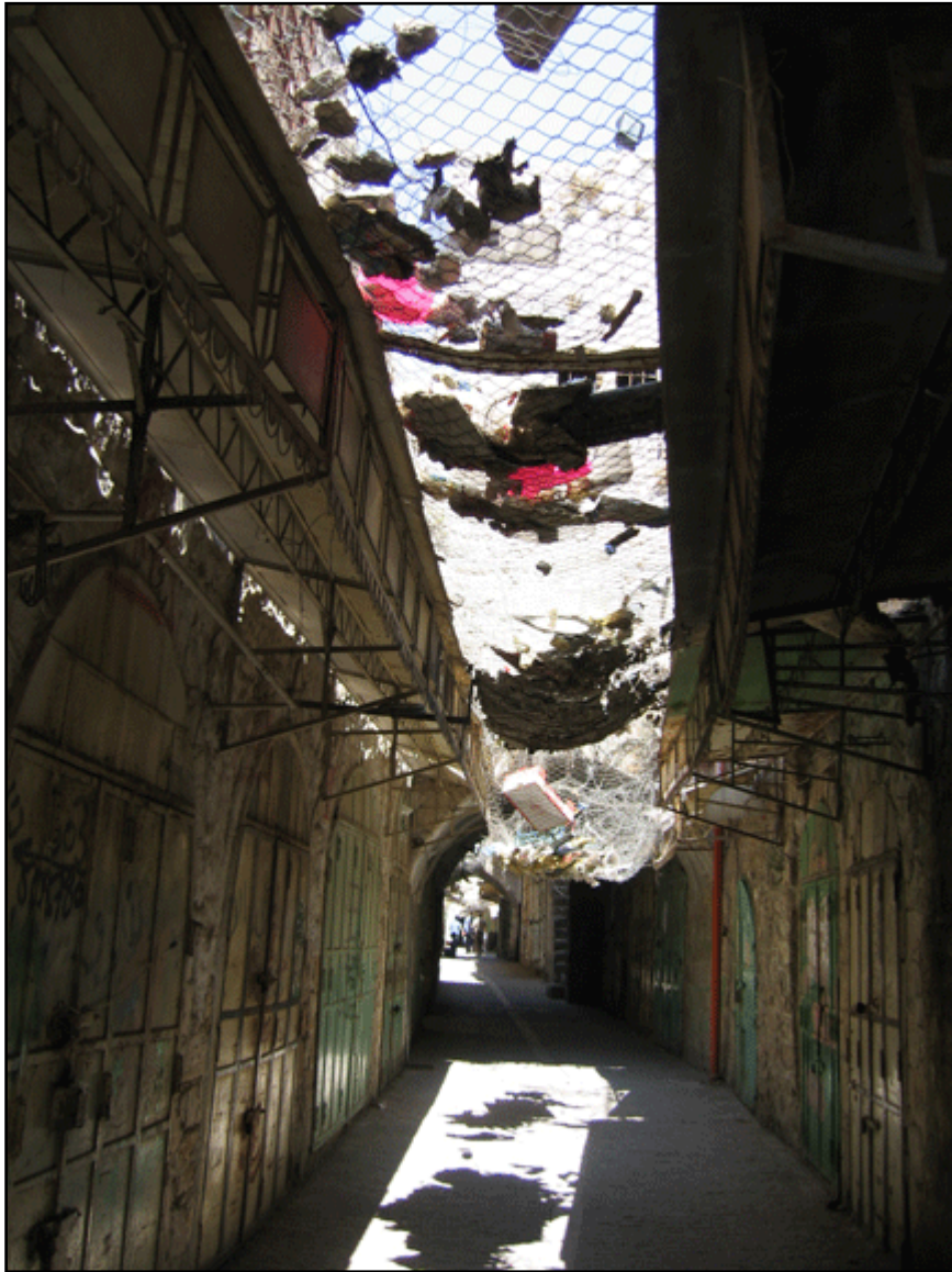
Closed Palestinian stores in H2, the Israeli-controlled area of Hebron.

our future.” Palestinian freedom of movement, even within the West Bank, is restricted by various mechanisms: earthen barriers, ditches, trenches, gates and terminals between Israel and the West Bank. 5 In