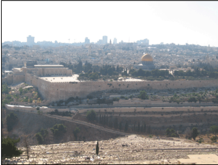
Jerusalem.

response. Yet this same response is ineffective against the broader systemic issues of the conflict, raising questions about the extent to which a humanitarian response has facilitated the occupation by not allowing the situation to get “bad enough” to force a political settlement. It also raises questions about the ability of the