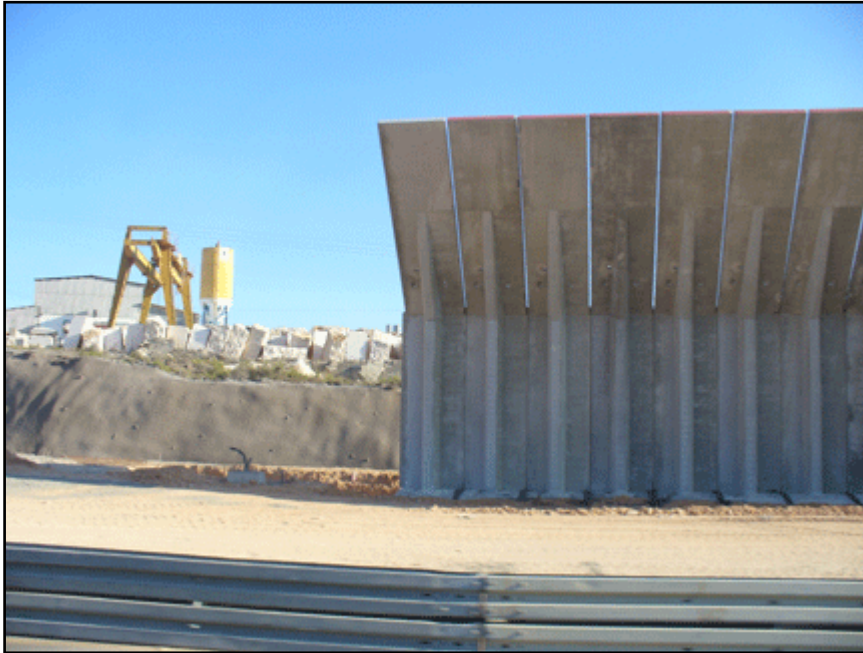
West Bank barrier, in progress.

Many of the humanitarian actors interviewed for this research admitted a sense of discomfort (and some resignation) with the idea that their work indirectly or directly allowed Israel to shirk its responsibilities under international humanitarian law (IHL) to provide for the Palestinian population that lives under Israeli occupation. 22 As a result, the central humanitarian issues are access and protection. The band-aid critique is not new or unique to the oPt, nor is it likely to disappear without a comprehensive peace agreement. As one interviewee summed