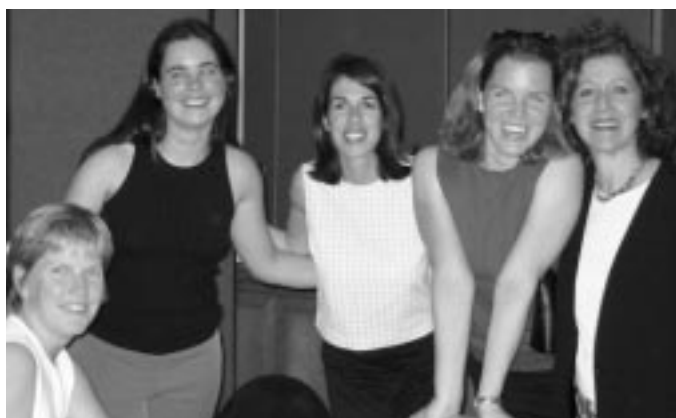
BSOT faculty, students, and alumnae gather at the BSOT Alumni Reception held during the AOTA Conference in Washington, D.C. June 6-9, 2003.