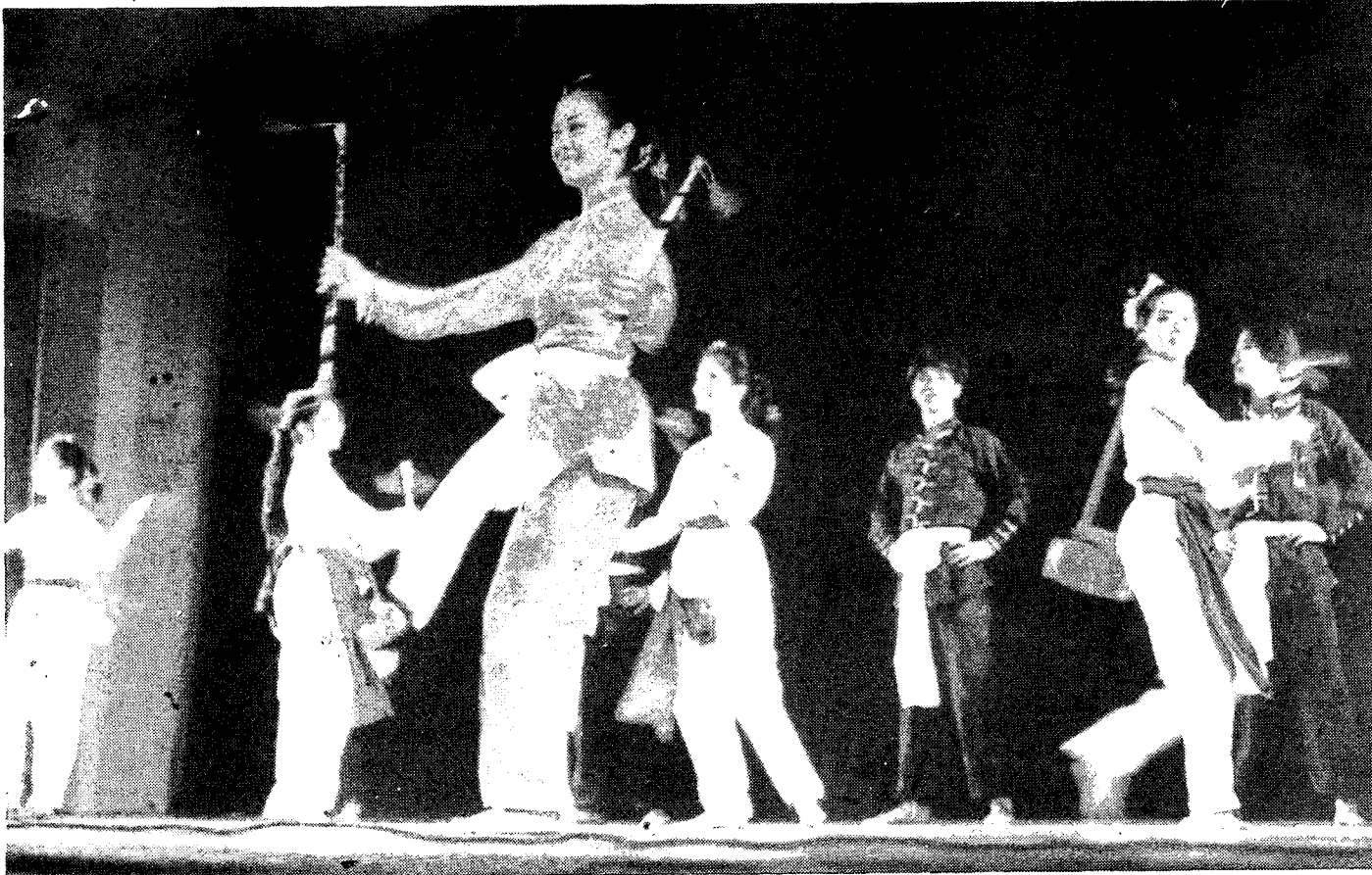
The Chinese Youth Goodwill Mission performed at Cohen Thursday night, mixing art and public relations. See review on page two.