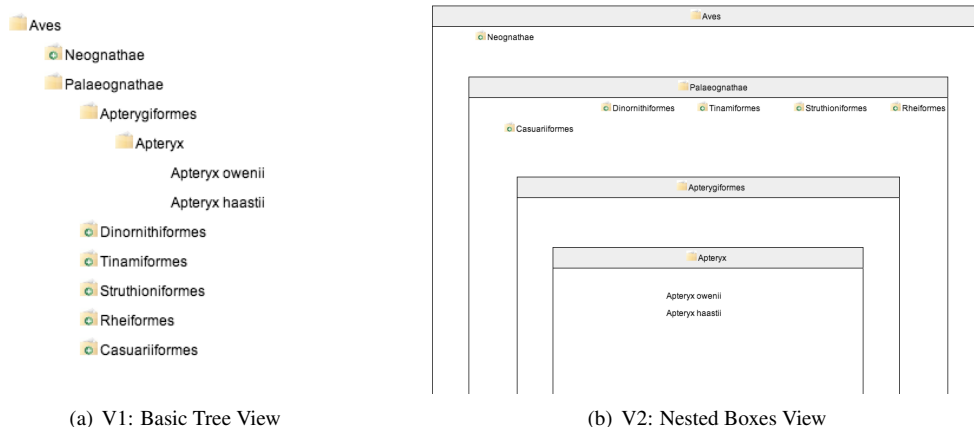
Figure 1: The two visualization used in the current study. They were two of the four visualizations designed by Ziemkiewicz et al [19]. V1 was designed to have a list-like metaphor while v2 was designed to be container-like.

For simplicity, we used only the most extreme views (see Figure 1) presented by Ziemkiewicz et al. [19], as their results were most compelling for these views. The order in which the views were presented was randomized, and participants were asked to complete a search and an inferential task for each view.