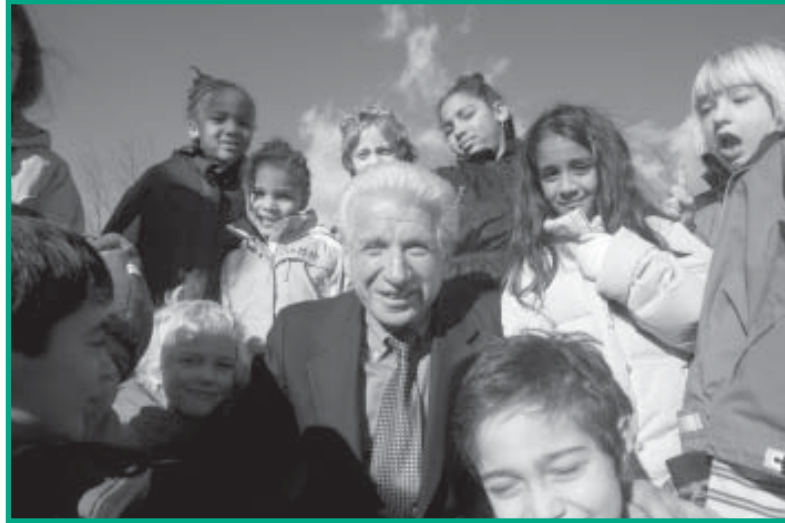
David Elkind with some of his colleagues

F or a scholar, there is no greater honor than to be given a festschrift on his or her retirement. Last May, David Elkind was given this honor, as the Eliot-Pearson community and distinguished guests gathered at the Granoff Family Hillel Center on the Tufts campus. The theme was “It All Begins With the Child.”