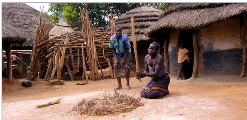
Women preparing grain harvested from their fields.

In some instances the shortage of labor is based on factors other than household demographics. Many respondents cited the negative effects of alcohol in this regard. For instance, an older woman in Labuje camp sells firewood and mangoes to support her family of eight, but she is the only working member of the household due to her husband's drinking and her children's fear of abduction if they leave the camp. 107