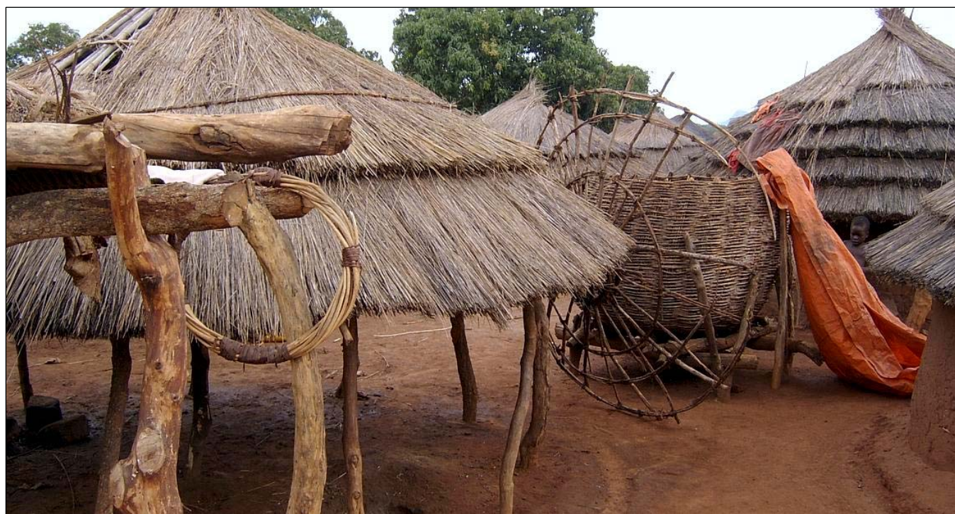
A granary with a temporary roof in Orom camp.

Recent studies indicate that many people have inadequate seed supplies and are thus at least partially dependent on NGOs for seeds. 18 To note, however, within the Tufts study population, many of those who had access to land were multiplying or purchasing part of their own seed needs, as well as using seeds provided by the NGOs, which were generally preferred based on quality and yield.