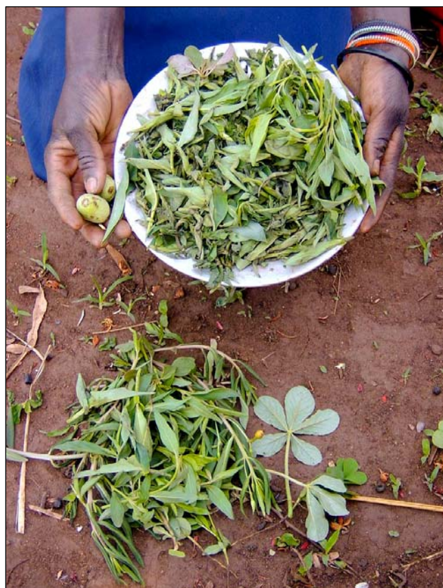
Woman displays variety of wild greens collected that morning from the bush.

The collection of wild greens and other seasonal fruits for consumption or sale is a common activity for residents in the camps and semi-settled villages. Many respondents said that wild greens can make up to half of their household food needs in the rainy season.