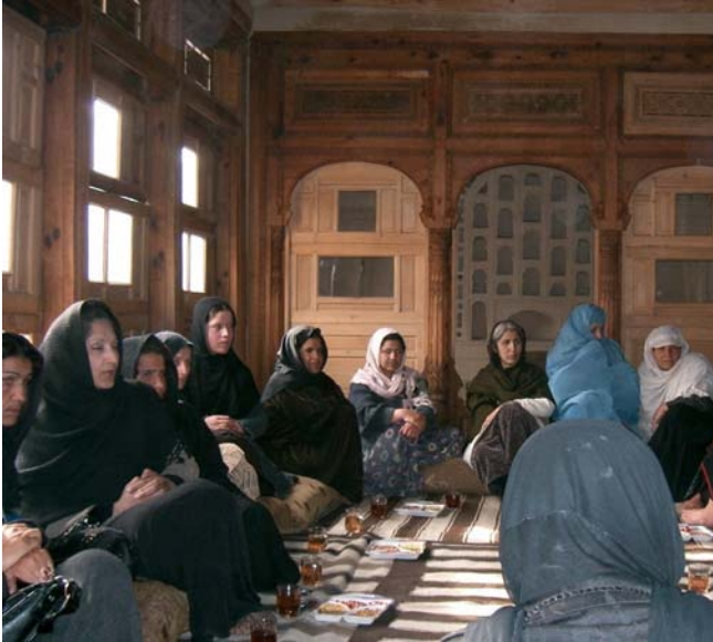
Female community meeting, Kabul (Old City), February 2006.

The corollary of this perceptions gap are yawning information, communication, and public relations gaps: agencies, whether NGO or UN, seem to be unable to explain in a credible manner what they are achieving with the funds entrusted to them by the international community. Their credibility is further undermined by the government's call for more international funds to be channeled through