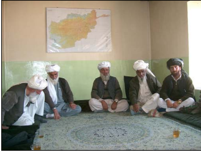
Tribal elders, Gardez.