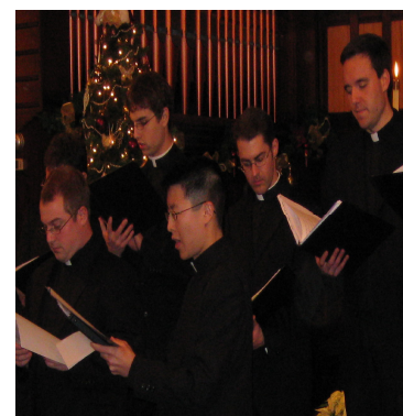
St. John Seminary School of Theology Schola