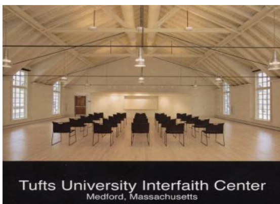
Tufts University Interfaith Center Medford, Massachusetts