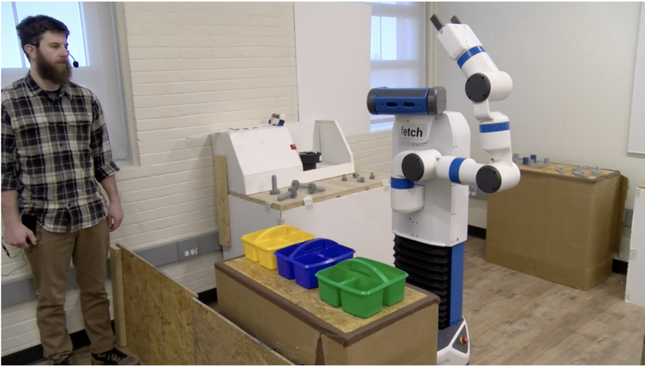
Fig. 2. Example HRI scenario referenced throughout the article as “the Fetch scenario.”

training data). In the context of a fully autonomous robot, the robot may assess its task knowledge and capabilities to determine whether it should accept or reject the task, or otherwise inform its human collaborator about its proficiency. In either setting, it is important for the robot to assess its uncertainty when attempting to complete a task according to its current task knowledge. Uncertainty-based metrics for self-assessment are discussed in Section 3.1.