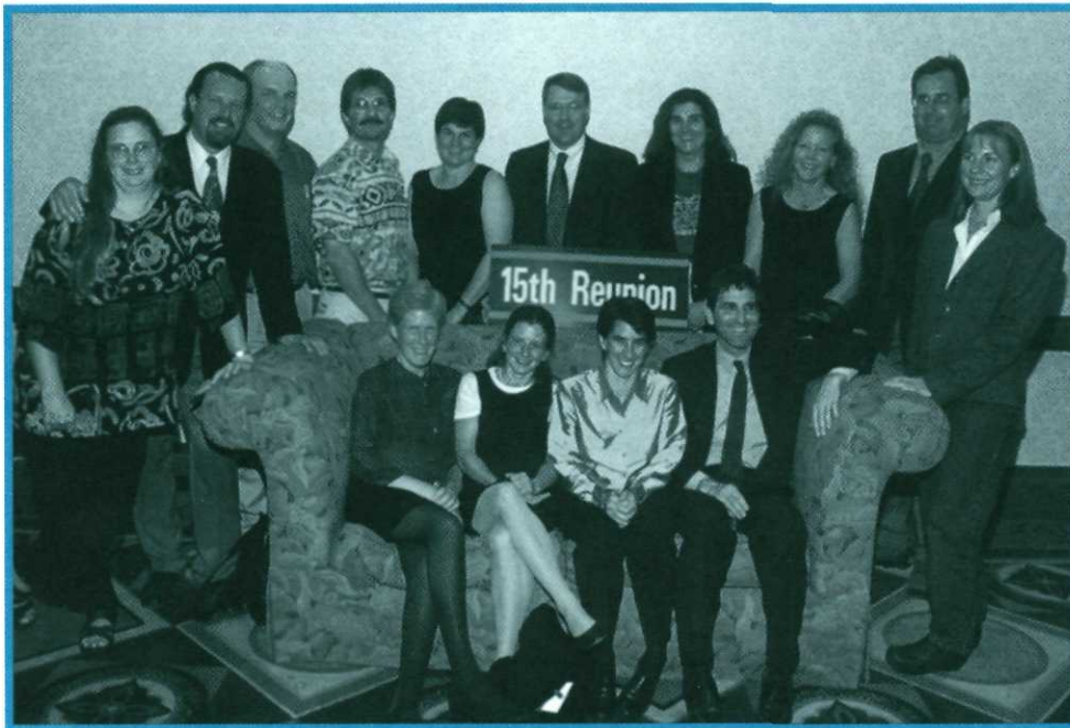
Fantastic turnout for the class of 1986!