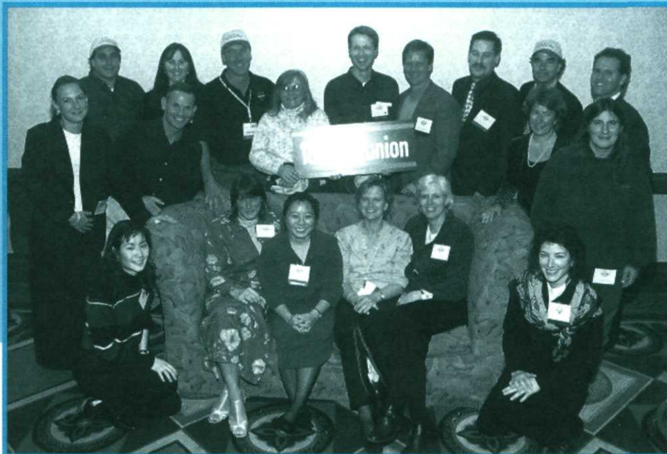
Great participation for Class of 1991!