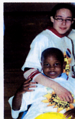
Tufts Giving Camp Volunteers and Participants

and mental challenges. Tufts students plan the events and serve as host for the guests of the day. Since the one-day pilot test in October, 2002, The Giving Camp at Tufts has been growing in the number of children and adults from the Medford and Somerville communities to be served. It is also a great way for many students to put into practice their book knowledge into real situations.