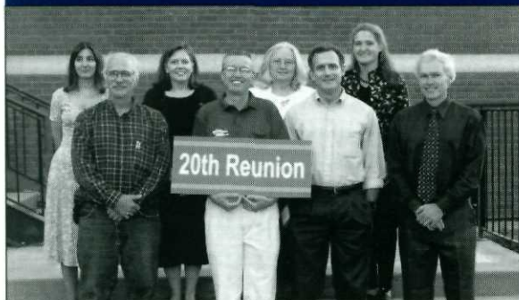
Members of the Class of 1983 who attended reunion