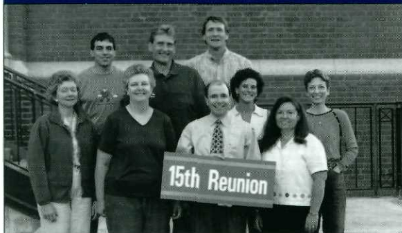
Members of the Class of 1988 who attended reunion