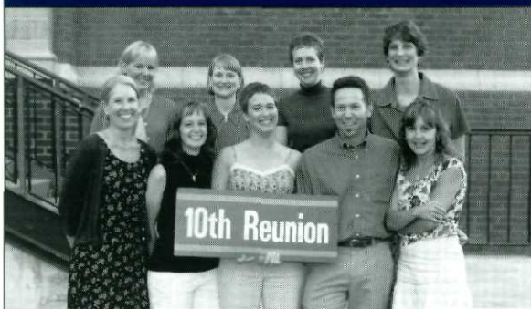
Members of the Class of 1993 who attended reunion