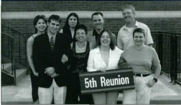
Members of the Class of 1998 who attended reunion