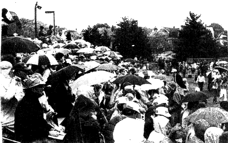
A loyal crowd pulled out umbrellas to brave the weather and watch the end of Saturday's game.