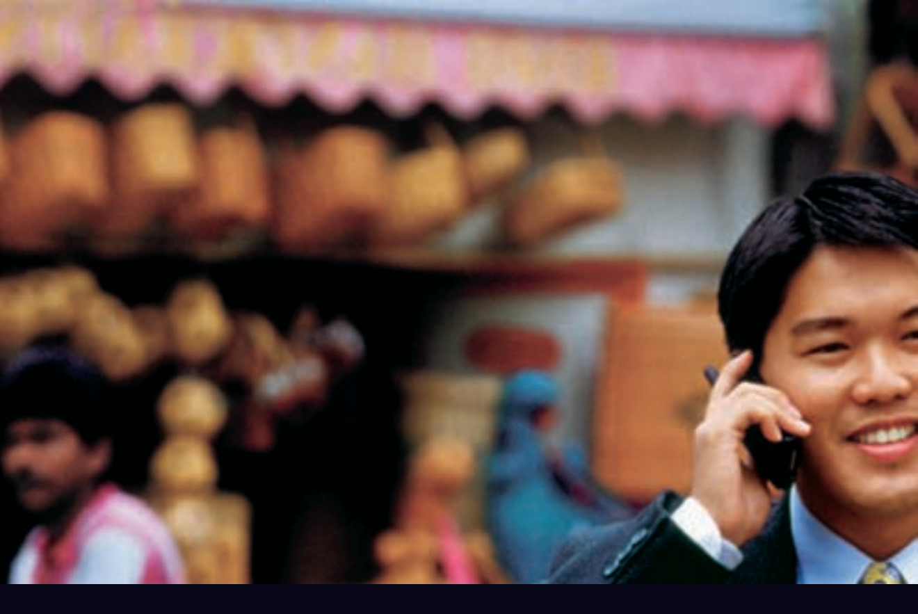
FLETCHER in the WORLD