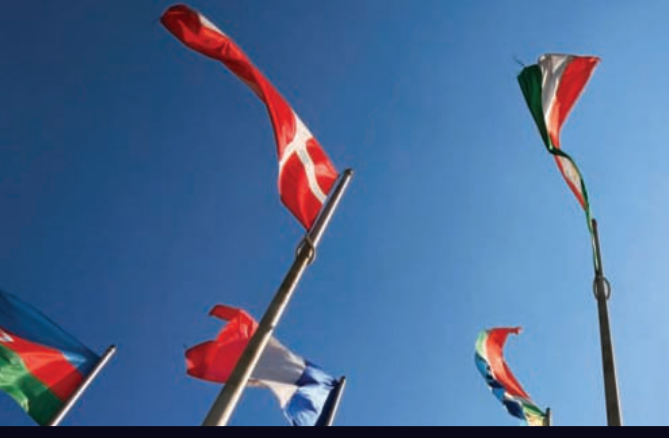
THE FLETCHER SCHOOL PREPARING THE WORLD'S LEADERS