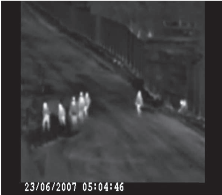
FIGURE 3.3. “Secure Border Intel”

offices and by civilian groups like Secure Border Intelligence, who provide interactive maps allowing users to explore grainy footage collected by night cameras, heat sensors, live radio streams, and mobile drones. Most of these videos, like the one in figure 3.3, show slow and seemingly endless processions of people walking “north,” while others depict the corralling and arrest of presumably immigrants by border patrol agents.