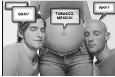
FIGURE 3.4. Mexico Surrogacy Law

rogates is telling, particularly since this absence is whitened , filled with images of white families and babies. Whiteness, of consuming families and future children, is prominently featured on web pages. When visible, pregnant bellies—as a stand-in for surrogate laborers—are often white or ambiguously raced.