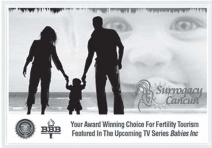
FIGURE 3.1. Surrogacy Cancun advertisement highlighting fertility tourism