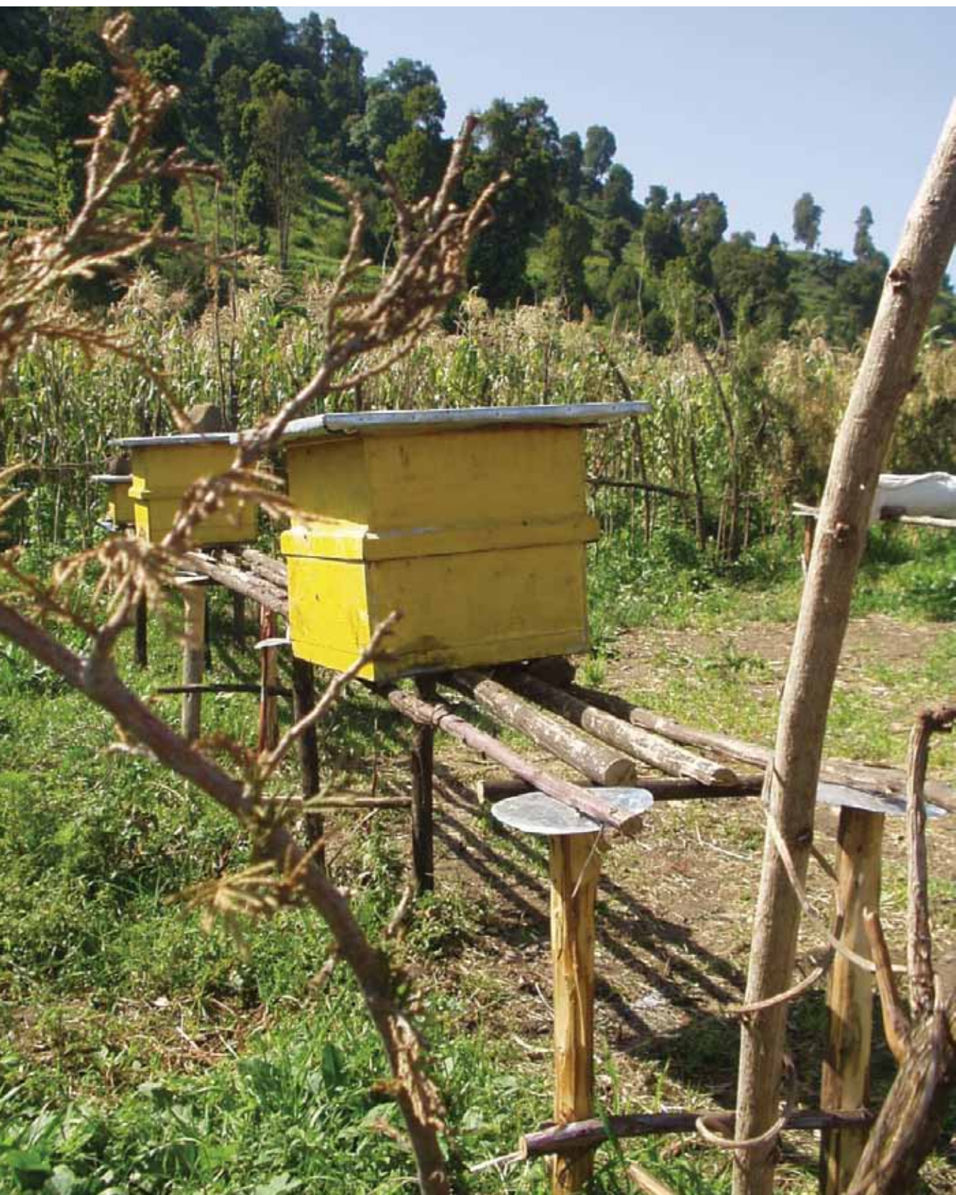
A modern beehive in Doba worda, West Hararghe, Ethiopia, provided by the PSNP Plus project.