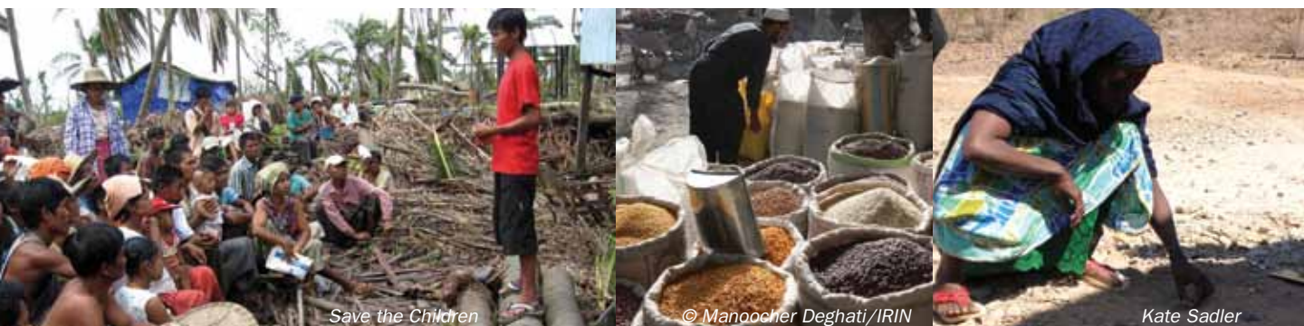
Save the Children