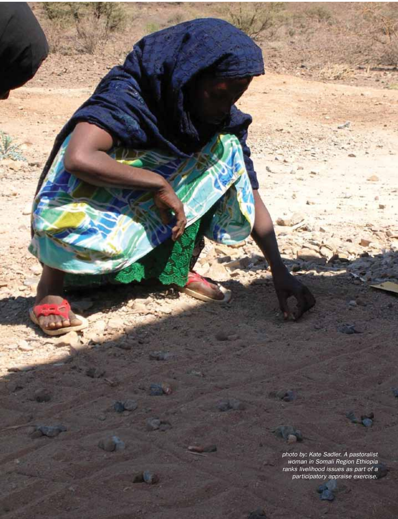
A pastoralist woman in Somali Region Ethiopia ranks livelihood issues as part of a participatory appraisal exercise.