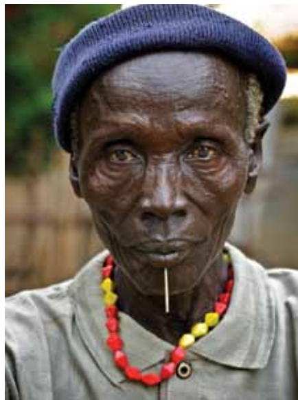
Seers, or diviners, live within pastoralist communities of the Karamoja Cluster of South Sudan, northeastern Uganda, northwestern Kenya and southwestern Ethiopia. Through divine instruction from their spirit-god, Akuju, seers are believed to be capable of intervening and altering the course of future events.