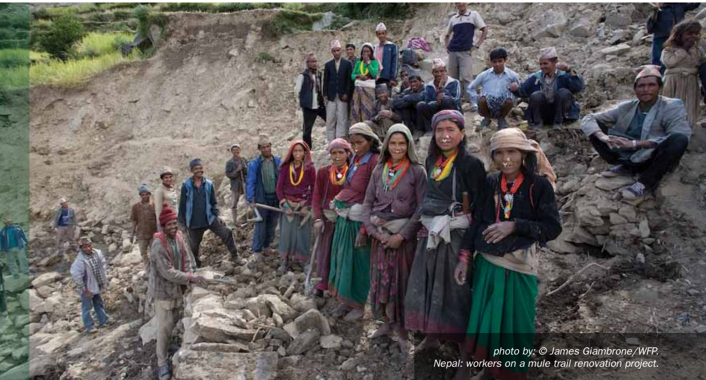
Nepal: workers on a mule trail renovation project.