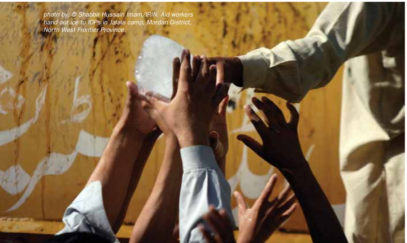
Aid workers hand out ice to IDPs in Jalala camp, Mardan District, North West Frontier Province.