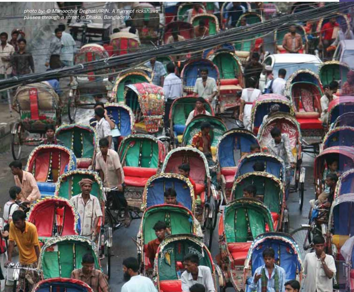
A flurry of rickshaws passes through a street in Dhaka, Bangladesh.