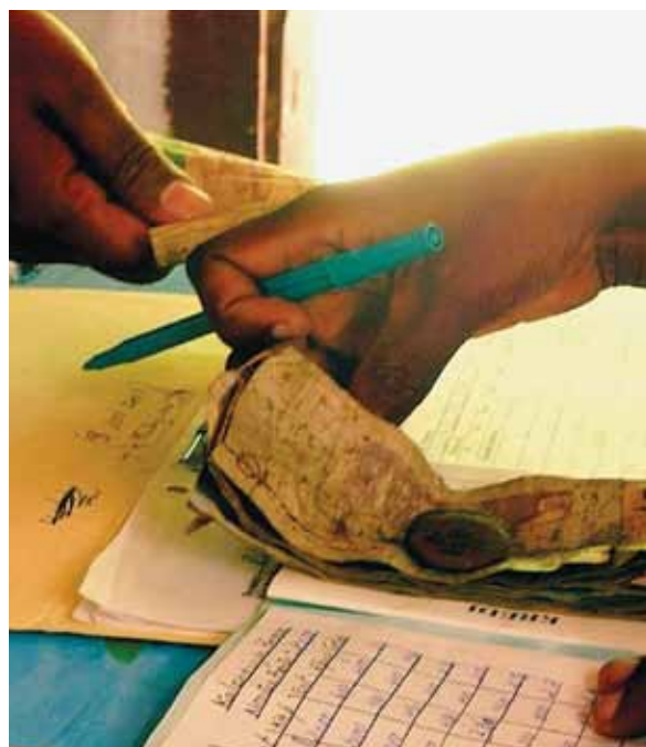
Savings groups in Haiti provided a vital local source of cash for rebuilding livelihoods after the earthquake.

In September 2010, we will begin a one-year research project that will further refine and test a profiling methodology intended to capture a range of livelihood, integration, and vulnerability data on displaced people in urban settings. The proposed research builds on earlier studies by Tufts/FIC, including the study of Sudanese refugees in Cairo, and presents an opportunity to apply our urban profiling toolkit methodology to three new displacement sites. This phase of the research will be conducted Yemen, South Africa, and Thailand, each of which has significant numbers of urban displaced people.