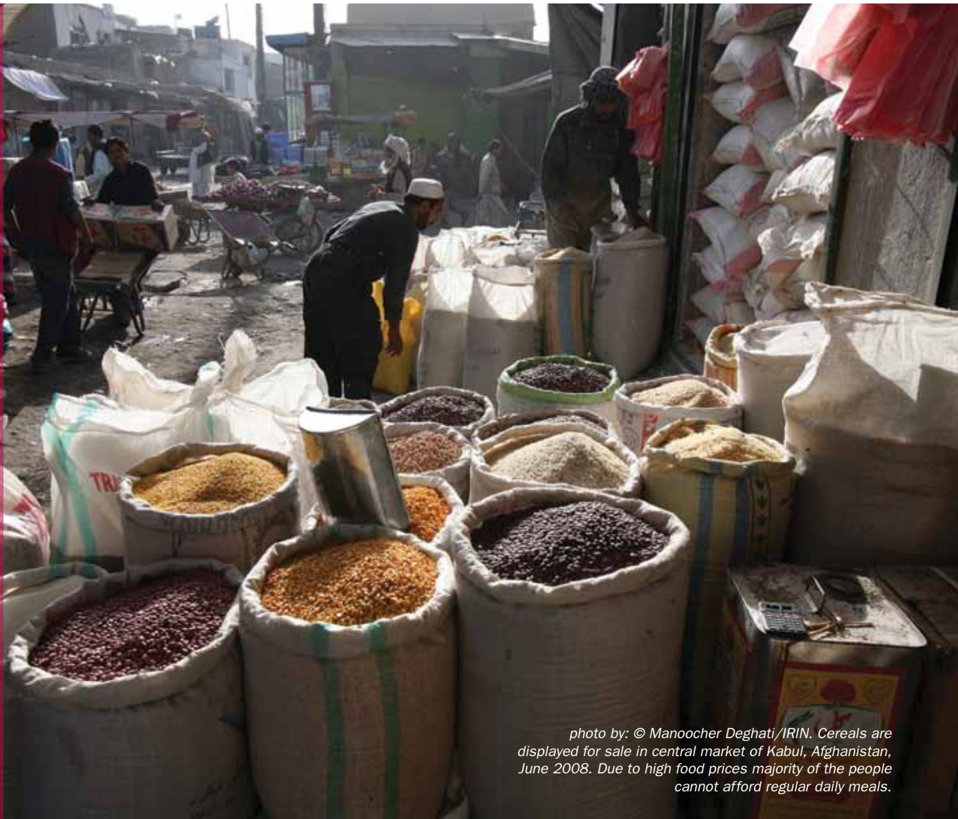
Cereals are displayed for sale in central market of Kabul, Afghanistan, June 2008. Due to high food prices majority of the people cannot afford regular daily meals.