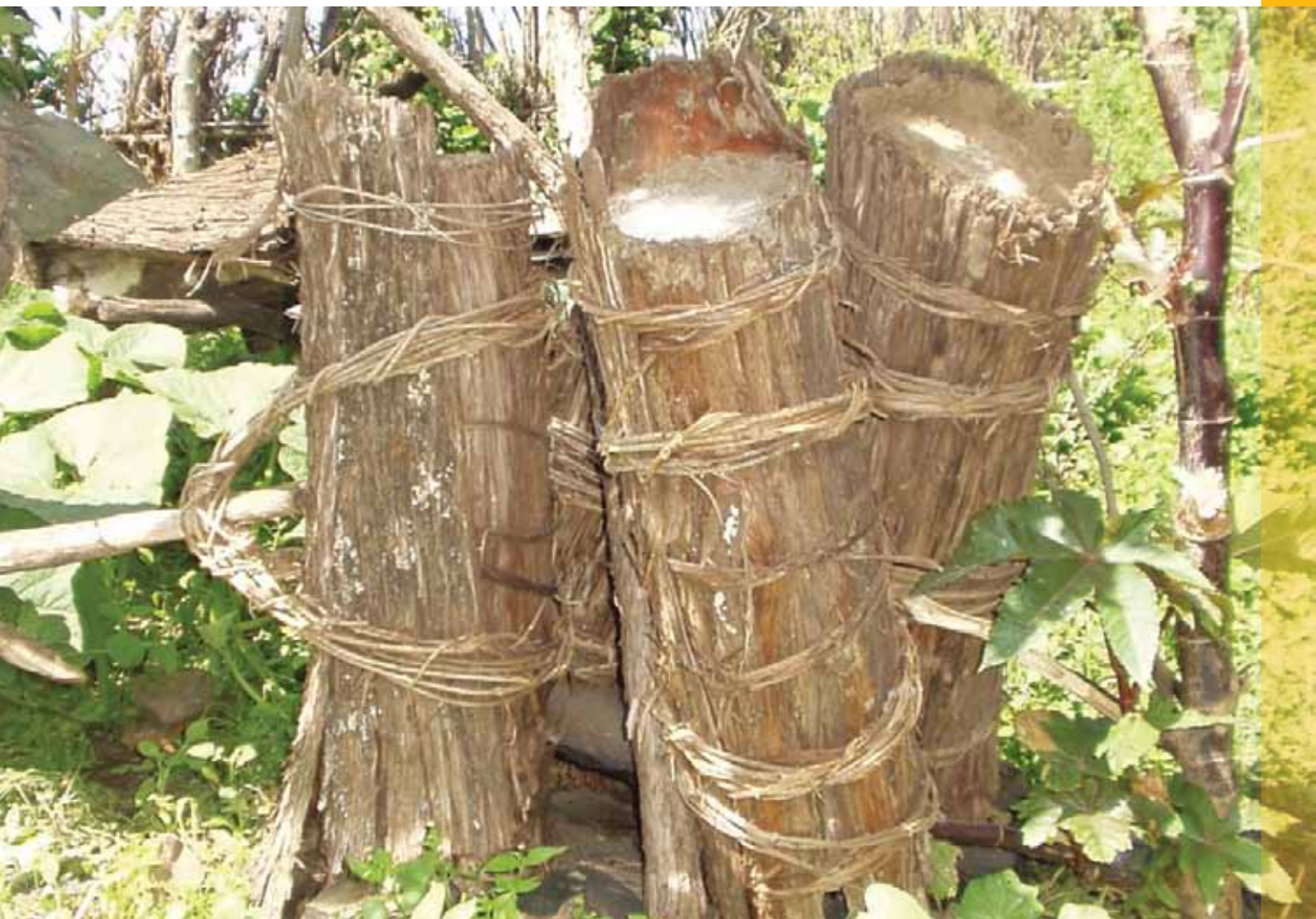
Traditional beehives in Doba woreda, West Hararghe, Ethiopia.