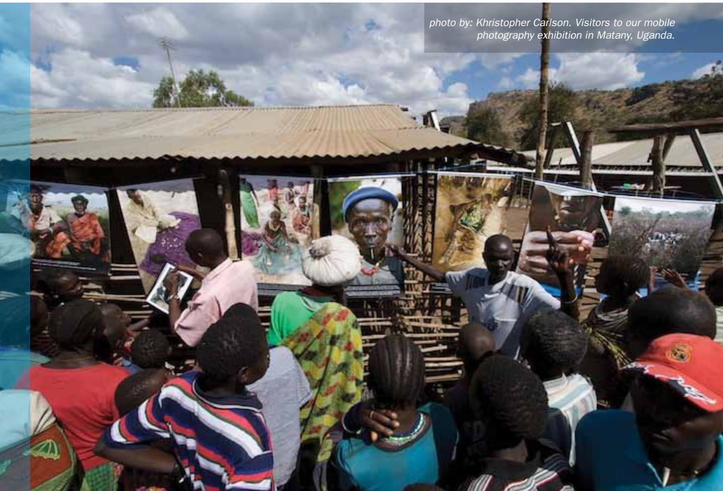
Visitors to our mobile photography exhibition in Matany, Uganda.