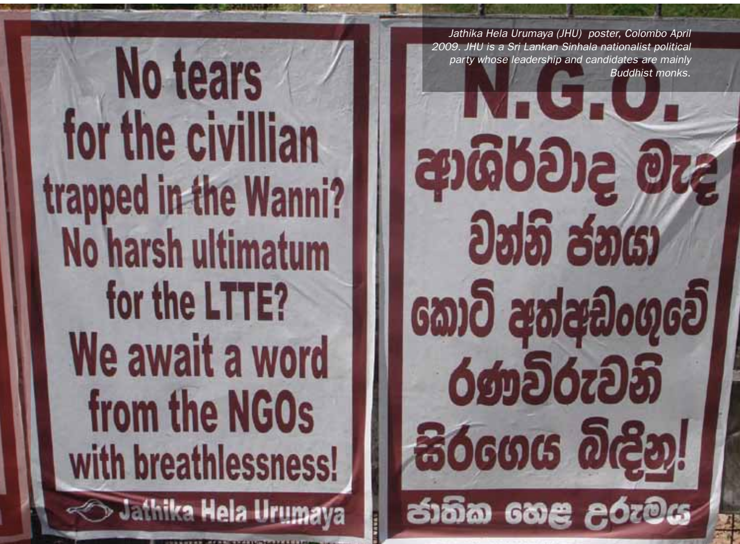
Jathika Hela Urumaya (JHU) poster, Colombo April 2009. JHU is a Sri Lankan Sinhala nationalist political party whose leadership and candidates are mainly Buddhist monks.