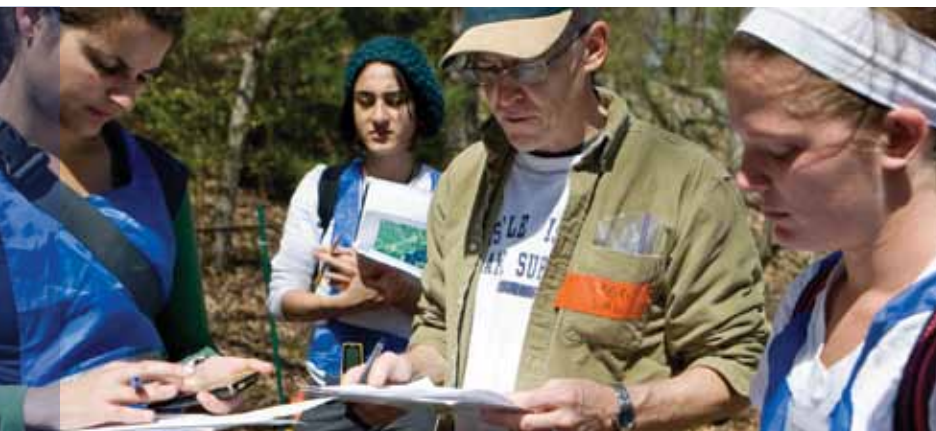
Tufts, Harvard and MIT students and faculty participate in a humanitarian disaster simulation exercise at Harold Parker State Forest in Andover, Mass. The simulation is part of a humanitarian studies course taught by the three schools along with other universities, medical centers and national and international aid organizations.