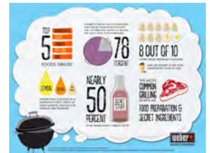
(d) m=6.69 , sd=2.46