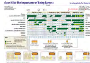
(a) m=2.68 , sd=2.05

Permission to make digital or hard copies of all or part of this work for personal or classroom use is granted without fee provided that copies are not made or distributed for profit or commercial advantage and that copies bear this notice and the full citation on the first page. Copyrights for components of this work owned by others than ACM must be honored. Abstracting with credit is permitted. To copy otherwise, or republish, to post on servers or to redistribute to lists, requires prior specific permission and/or a fee. Request permissions from Permissions@acm.org . CHI 2015 , April 18–23, 2015, Seoul, Republic of Korea. Copyright is held by the owner/author(s). Publication rights licensed to ACM. ACM 978-1-4503-3145-6/15/04$15.00 http://dx.doi.org/10.1145/2702123.2702545