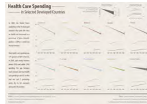
(c) m=3.35 , sd=3.84