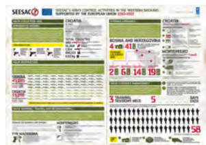
(e) m=3.70 , sd=3.34