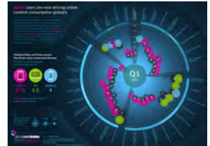
(f) m=6.60 , sd=3.19