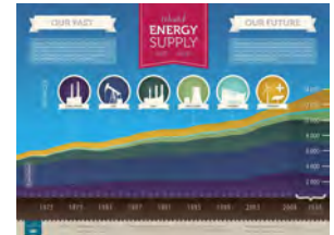
(b) m=6.50 , sd=3.19