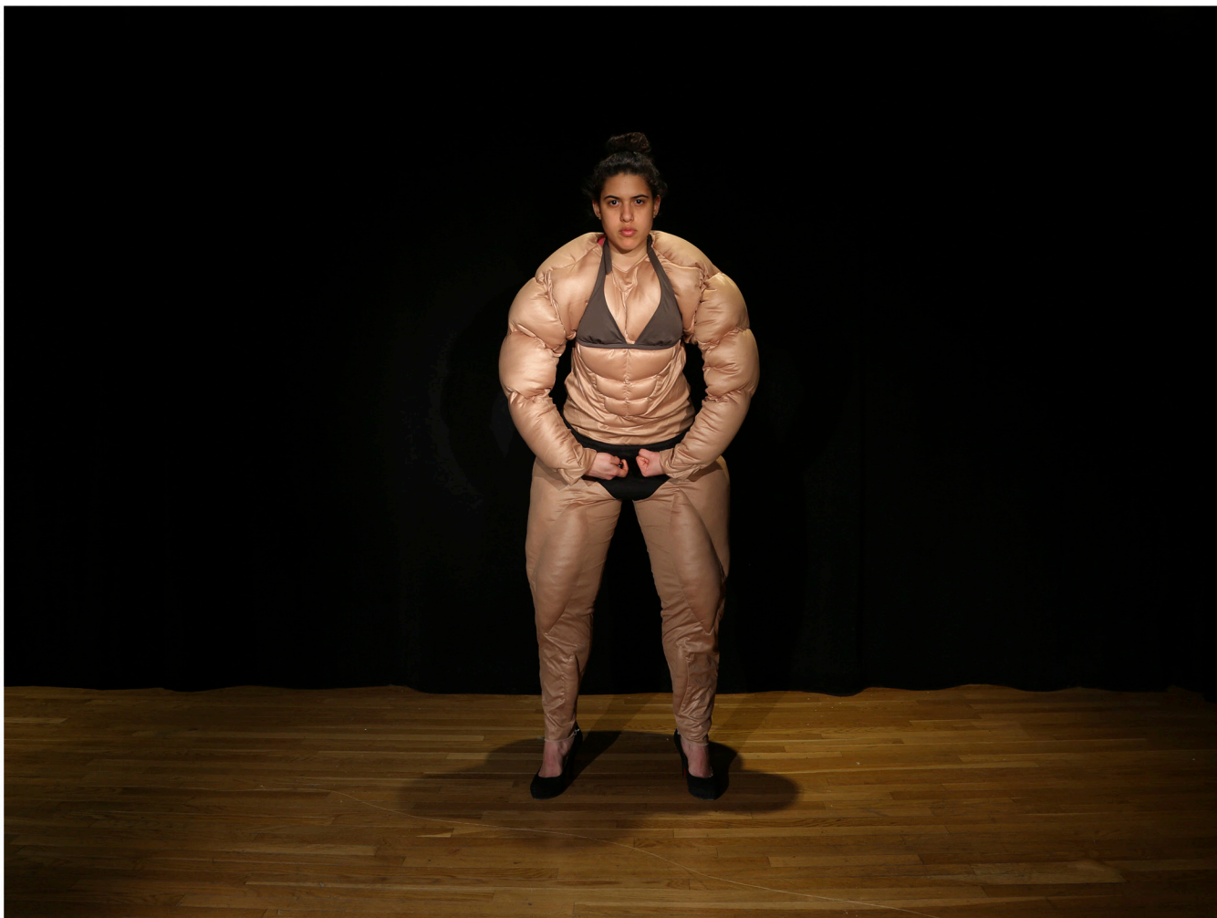
Strong Arm from the series of Ongoing Performance, I Can look Strong, I am Strong