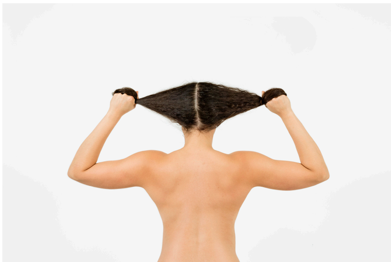
From The Series Pulling , Archival Inkjet Print, 2016