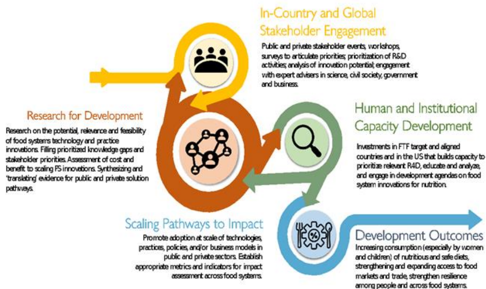
Figure 1. Food Systems for Nutrition Innovation Lab's Theory of Change Framework

For R4D, the theory of change involves three key steps supporting transmission of i) “on-the-shelf” and/or “potential” nutrition-sensitive solutions (technologies, evidence, practices) to ii) potential users, leading to iii) wide adoption, with clear benefits to ultimate beneficiaries. Along this pathway from discovery to impact, FSN-IL will identify candidate solutions, prioritize options for real-world testing or further adaptation, establish rigorous evidence on feasibility, costs, and potential benefits along the value chain, disseminate findings, and document scalability. HICD includes activities that support both LMIC and U.S. institutions and stakeholders and raise capacities to generate and transfer knowledge, technologies, and practices for nutrition-sensitive food systems. Engagement will involve wide-ranging activities that will aim to enhance in-country academic, business and policymaker understanding of, and interaction with, relevant R4D and HICD activities while engaging regional and global stakeholders.