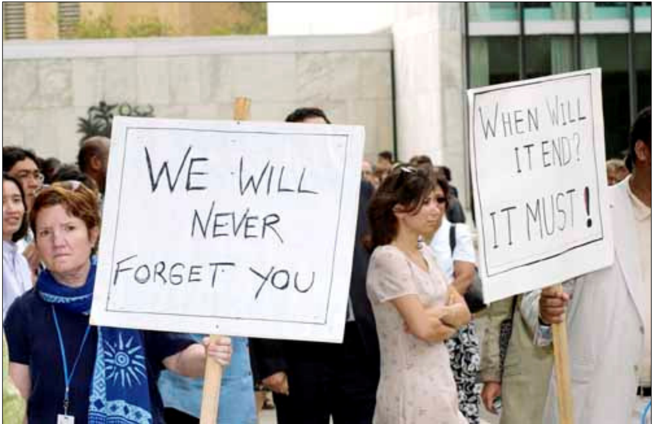
Staff members march to honor their colleagues killed and injured in the bombing of U.N. headquarters in Baghdad.

instrumentalized assistance. The “Western” or “Northern” humanitarian presence in Iraq has diminished in scale, but it has also become “hidden” to the extent that it is virtually invisible to populations in the central and southern regions. Local humanitarian organizations do only somewhat better, and are not immune to serious difficulties. The Iraqi Red Crescent Society (IRCS) maintains presence and programs virtually country-wide, often with high profile. In December, 2006, a large number of IRCS staff were kidnapped from the central Red Crescent office in Baghdad, compelling a temporary suspension of work in the city. Although many of the kidnap victims are still being held, IRCS programs in the remainder of Iraq have so far continued.