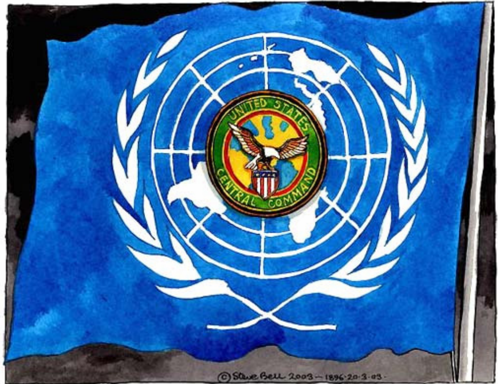
A cartoon by Steve Bell, appearing in The Guardian on March 20 th , 2003, the start of the U.S. invasion.

U.S. Central Command Press Release, April 4, 2007.