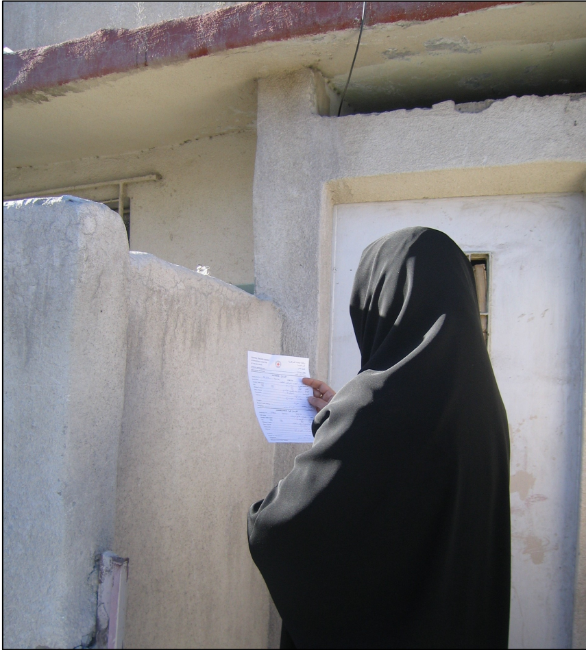
Iraqi woman reading a Red Cross message.

distribution points, killing several drivers, forcing changes to previous distribution routes, and cessation of deliveries to some areas. Several interviewees in various locations in Iraq spoke of being unable to collect their ration because they had fled their homes without their ration cards.